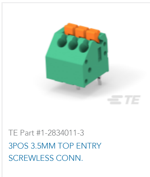
TE Part #1-2834011-3 3POS 3.5MM TOP ENTRY SCREWLESS CONN.