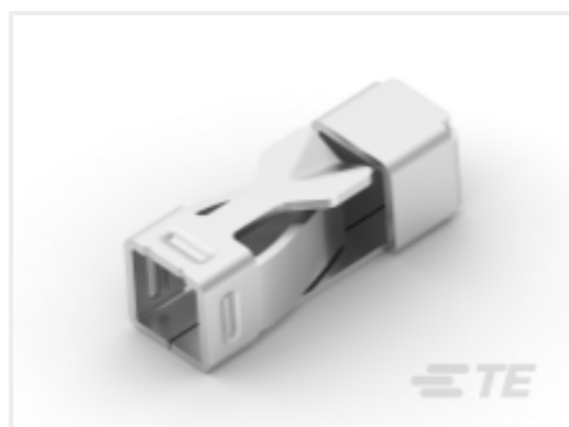
TE Part # 2834167-3 RELEASABLE SLIM CONTACT