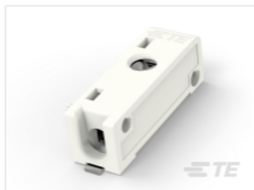
TE Part # 2834006-1 RELEASE POKE-IN CONNECTOR_1POLES