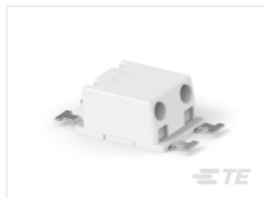
TE Part # 2834334-2 4.0PITCH ITB CONN_2P_W CAP_NATURAL