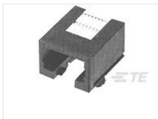
TE Part #1-215877-3 8/8 PCB MOD.JACK SE