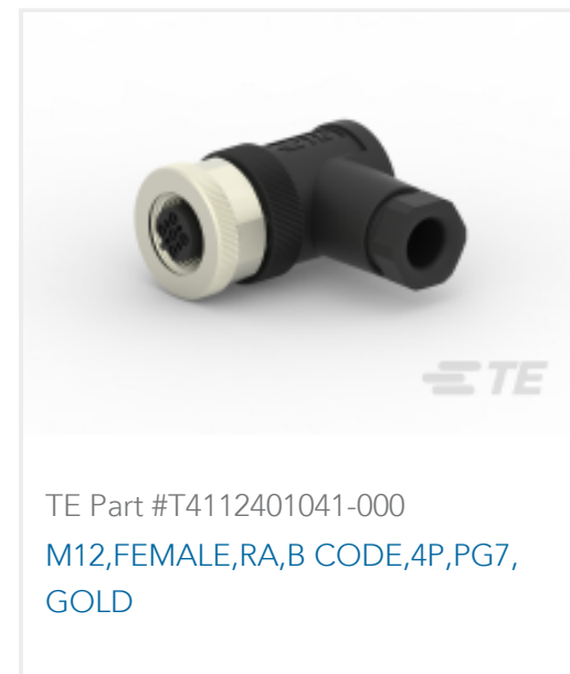
TE Part #T4112401041-000 M12,FEMALE,RA,B CODE,4P,PG7, GOLD