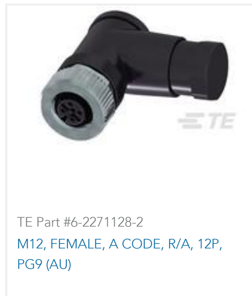
TE Part #6-2271128-2 M12, FEMALE, A CODE, R/A, 12P, PG9 (AU)