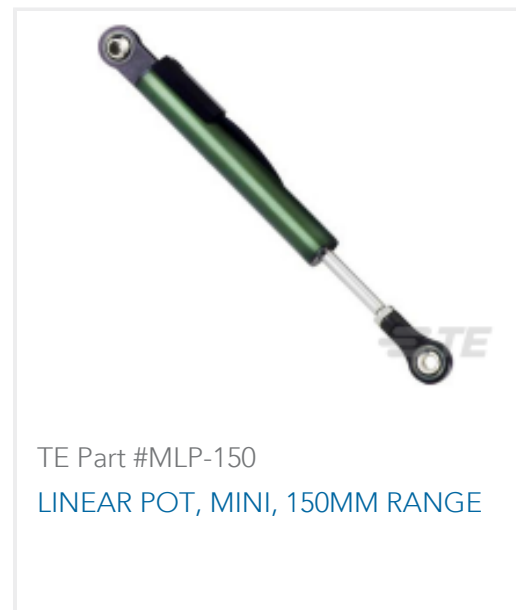
TE Part #MLP-150 LINEAR POT, MINI, 150MM RANGE