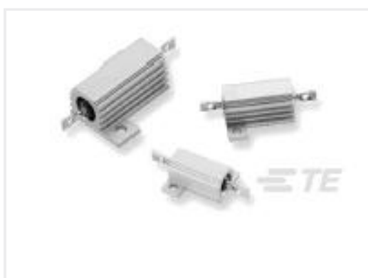
TE Part #4-1879071-8 THS50 500R 5%