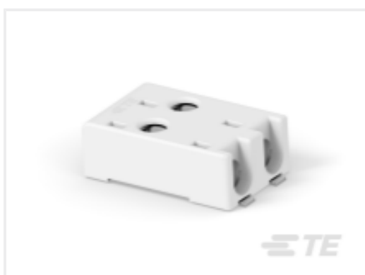
TE Part # 2834385-2 RELEASE POKE-IN CONNECTOR_2P_NATURAL