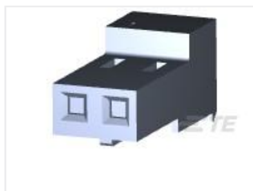
TE Part #3-640432-2 02P MTA156 CONN ASSY 20AWG YEL