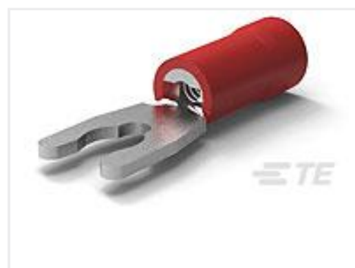
TE Part #52949-1 PG SFR SPD 22-16COMM 22-18MIL6