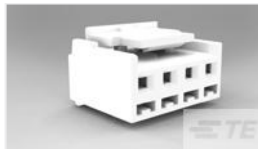
TE Part #2132781-8 08P EP-II HOUSING, NATURAL