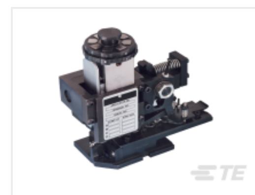
TE Part # 1385813-1 U.POD .250 SAPR110F220O DUAL