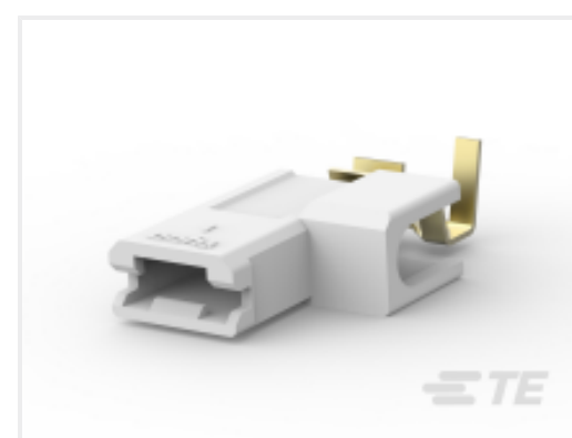
TE Part # 1969109-1 ULTRA-POD 250 ASSY REC 18-14 AWG BR