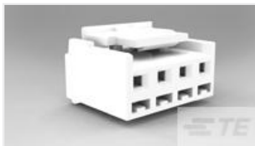
TE Part #2132781-7 07P EP-II HOUSING, NATURAL