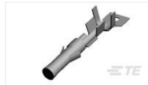
TE Part #770529-1 .093 COMM P&S SOK 14-20 PTPBR