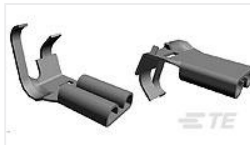
TE Part #42486-2 187 FASTON FLAG REC 20-16 AWG TPBR