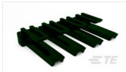
TE Part #1-2132782-2 12 pos. EP II breakaway retain