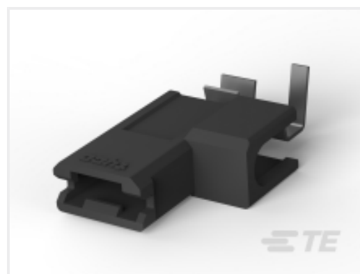
TE Part # 521087-1 ULTRA-POD 250 ASSY REC 18-14 AWG NPST