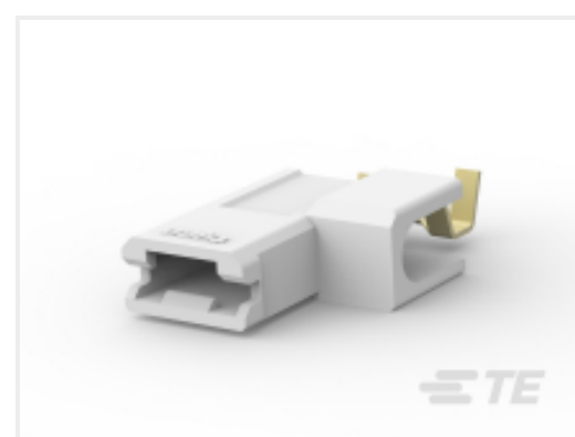
TE Part # 521411-1 ULTRA-POD 250 ASY REC 22-18 AWG BR