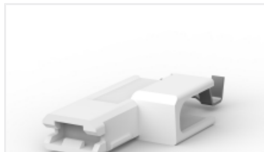
TE Part #521597-2 ULTRA POD: Flag, Receptacle Assembly, Tin Plated, .187 inch