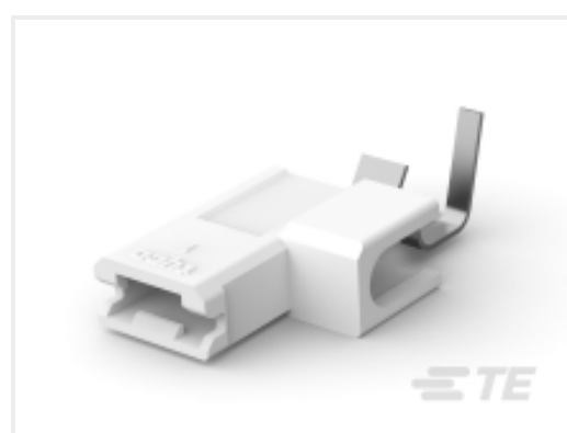
TE Part # CAT-UL8-25021 ULTRA POD: Flag, Receptacle Assembly, Tin Plated, .250 inch