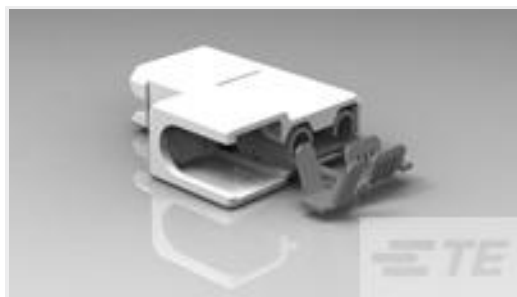
TE Part #521411-2 ULTRA-POD 250 ASY REC 22-18 AWG TPBR