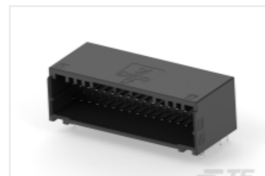
TE Part #1-2372488-7 D1100 HDR ASSY H 34P XBLACK PRE- TIN