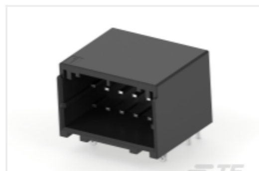
TE Part #2-1827875-3 Header Assembly: Wire-to-Board, 5A, gold or tin plated