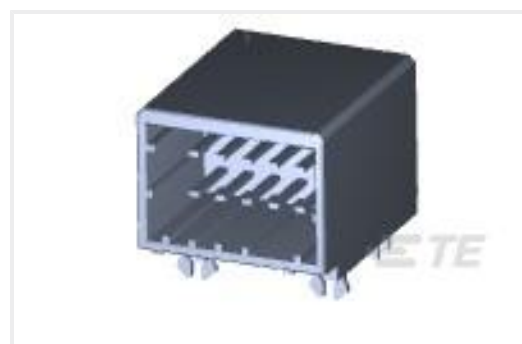
TE Part #1376020-2 DYNAMIC D2100 HDR H ASSY 12P Y