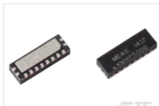
TE Part #G-MRCO-052 5MM PITCH AMR POSITION SENSOR KMXP