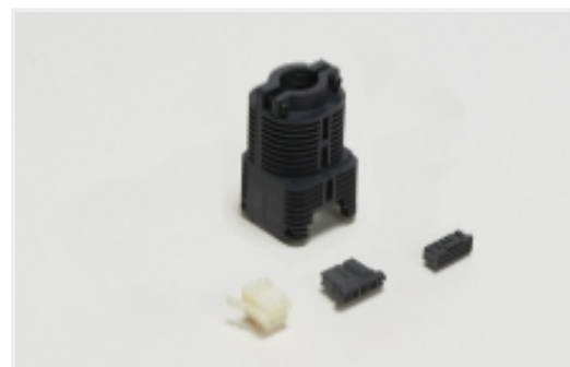
Rectangular Connector Housings(2)