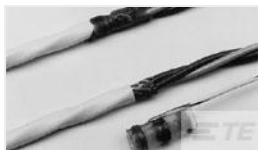
TE Part #839158-000 SO63-5-55-20-90