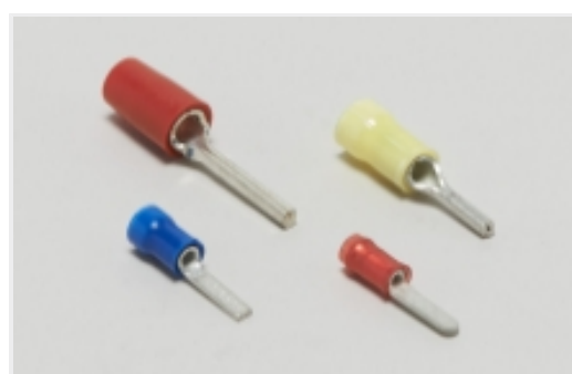
Crimp Wire Pins, Tabs & Ferrules(18)