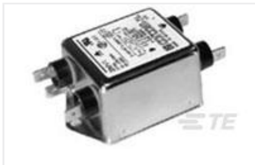
TE Part #6609056-1 3MV1=F7756 S0