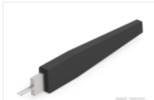
TE Part #1586344-1 MICRO MATENLOK EXTRACTION TOOL