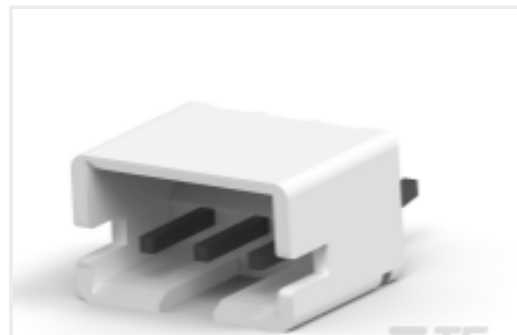
TE Part #1-440054-1 AMP HPI 2.0 mm Headers