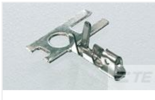
TE Part #1735801-1 2.0mm,Crimp,Contact