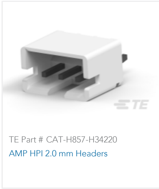
TE Part # CAT-H857-H34220 AMP HPI 2.0 mm Headers