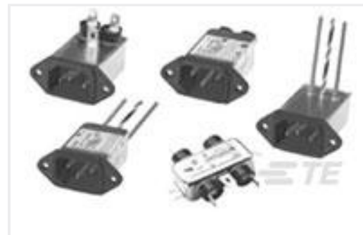
TE Part #6609012-1 3EH1=F7645 S0