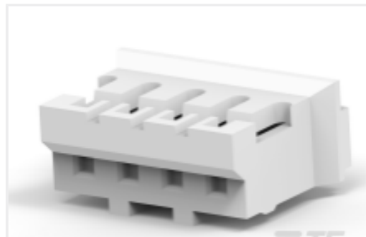
TE Part #440129-4 AMP HPI 2.0 mm Receptacle Housings