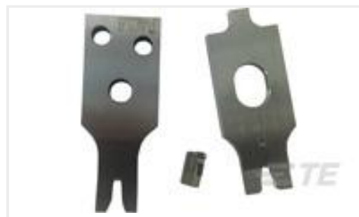
TE Part #7-2151018-7 OCEAN_2.0_SPARE_PART_KIT-090F110F