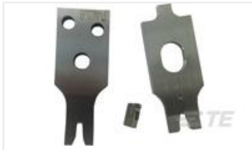
TE Part #7-2266273-7 OCEAN_2.0_SPARE_PART_KIT-S-110F190F