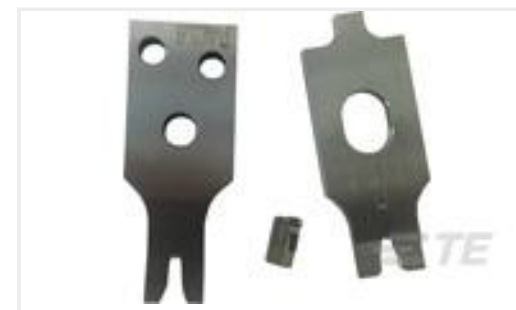
TE Part #7-2151893-7 OCEAN_2.0_SPARE_PART_KIT-070F100F