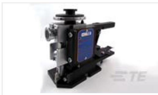
TE Part #2150049-1 OCEAN-2.0-APPLICATOR-E-062F090F-REM