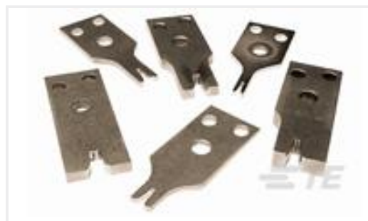
TE Part #3-456404-8 CRIMPER, WIRE .070 F