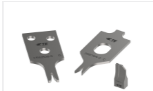
TE Part #7-2836223-7 OCEAN_2.0_SPARE_PART_KIT-100F140F