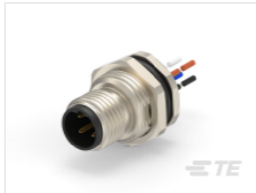
TE Part # T4171010404-801 M12, REAR MOUNT, MALE, B, 4P, 0.2M WIRE