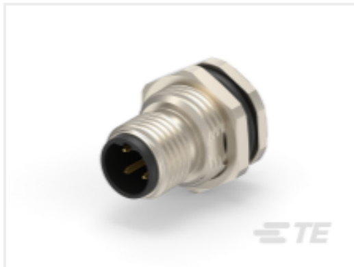
TE Part # T4130412041-001 M12, REAR MOUNT, MALE, B, 4P, SOLDER WIRE