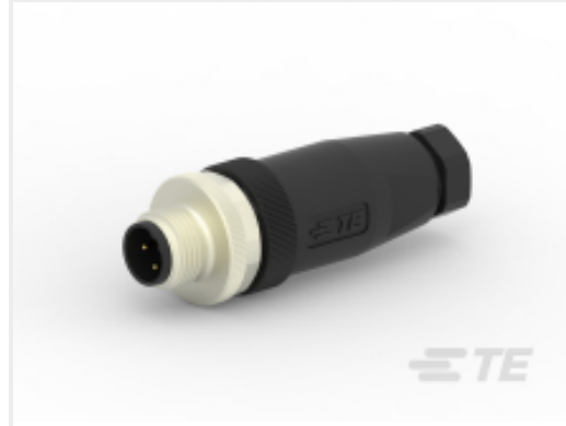
TE Part # T4111401041-000 M12, MALE, STRAIGHT, B CODE, 4P, PG7, GOLD