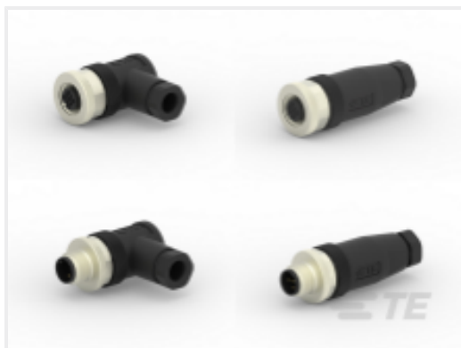
TE Part #T4112001081-000 M12 Field Installable Unshielded