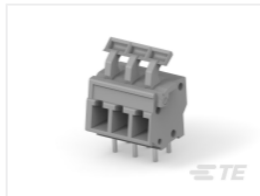
TE Part #2834082-2 5.0MM SIDE ENTRY MSC 3P_GY M WIRE