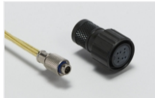
Standard Circular Connectors(793)