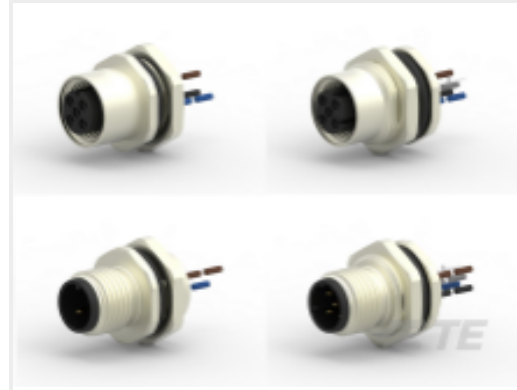
TE Part # CAT-C73765-M1F M12 Panel Mount Wire