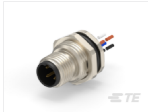
TE Part # T4171010404-802 M12, REAR MOUNT, MALE, B, 4P, 0.5M WIRE