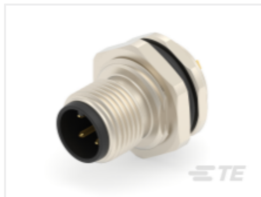
TE Part #T4130012041-000 M12, REAR MOUNT, MALE, A, 4P, SOLDER WIRE