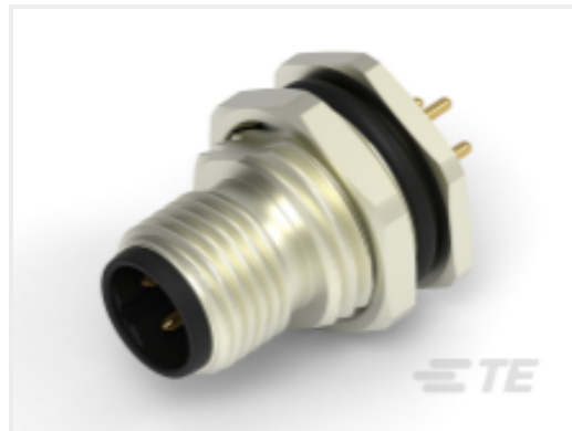
TE Part # T4140416041-000 M12, REAR MOUNT, MALE, B, 4P, M16, POTTING