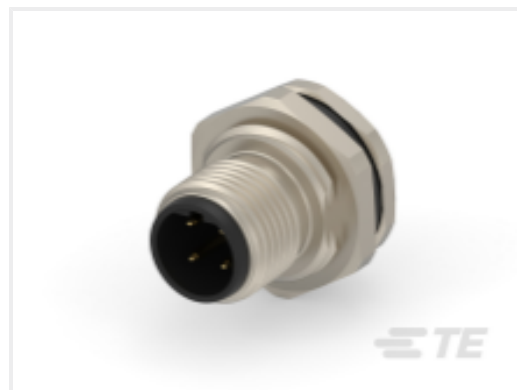
TE Part #T4171010404-001 M12, REAR MOUNTING, MALE, B, 4P, 0.2 M WIRE