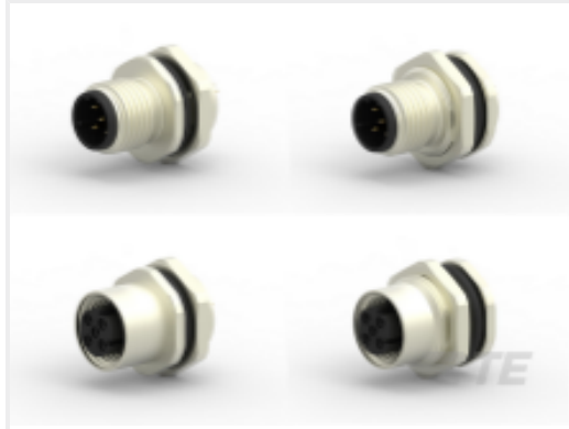
TE Part # CAT-C73765-M1G M12 Panel Mount Solder Cups