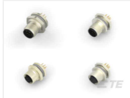
TE Part # CAT-C73765-M1H M12 Panel Mount PCB