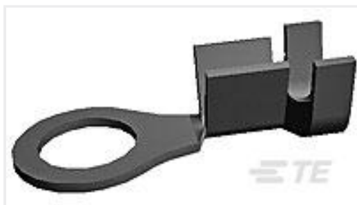
TE Part #41124 RING .190 (4.82 MM) 12-10 AWG TPBR