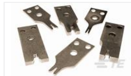
TE Part #5-456135-9 CRIMPER, INSULATION "O"(.210")