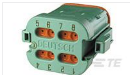
TE Part #DT06-08SC-CE05 PLG, 8P, GRN, E, SEAL RET, CAP, C