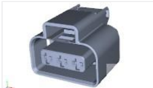
TE Part #1326460-1 ASSY, PLUG, 3P SEALED, 2.8MCP