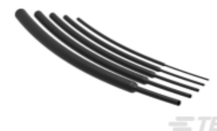
TE Part #EG6995-000 RNF-100-1/2-BK-FSP-250KFT