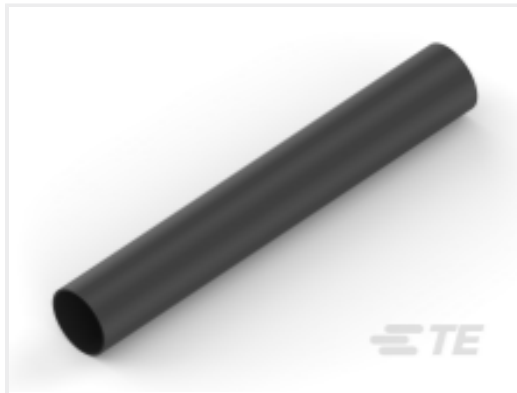
TE Part #NB17012001 DWP-125-1-1/2-0-STK