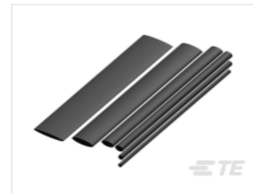
TE Part #NB15704001 RNF-150-1/2-0-SP