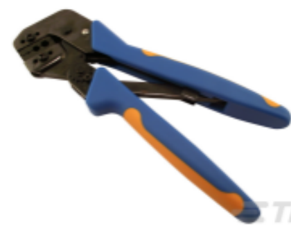
TE Part # 58433-3 PRO CR ASSY, RBY IS9252