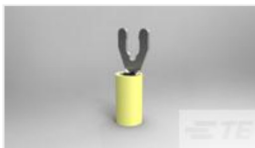
TE Part #52943-1 TERMINAL,PIDG SPR SPD 12-10 10