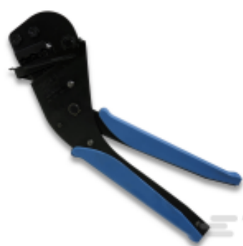
TE Part # 59824-1 TETRA-CRIMP PIDG PG FASTON 22-10 ASSY