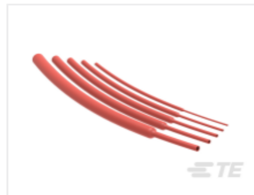
TE Part #NB13404001 RNF-100-3/4-RD-FSP