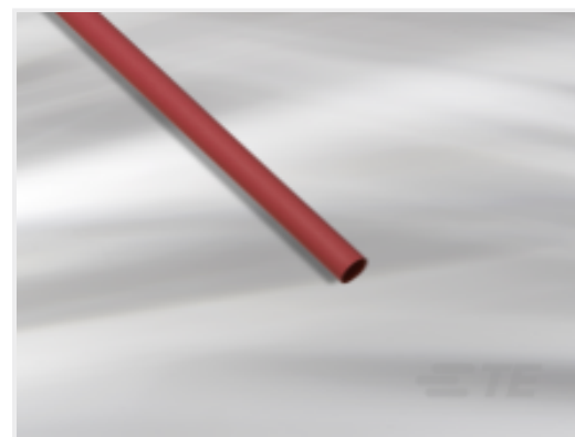
TE Part #NB07132001 BATTU-20.1/8.9-A1-2-STK