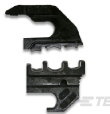
TE Part # 169404 CERTI-LOK DIE