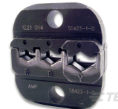
TE Part # 58423-1 DIE, RBY IS9252