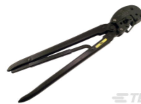
TE Part # 59239-4 HHHT PIDG PG 12-10 ASSY