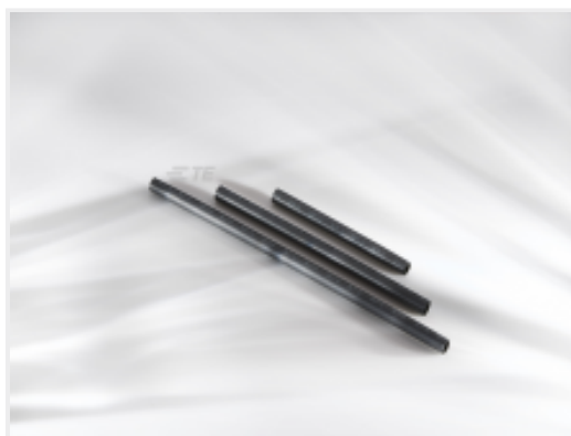
TE Part #CZ0181-000 SCT-NO.5-Z4-0-STK