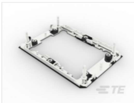
TE Part #2-2330550-1 SOCKET P4 BOLSTER PLATE ASSY, W /O COVER