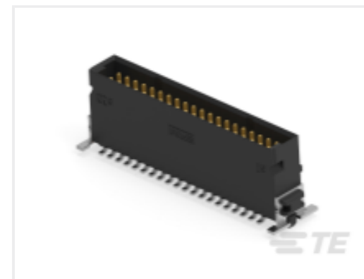
TE Part #254417-E SMCQ 40 M AB VV 8-23 CL * H007 137 E005