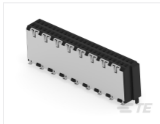
TE Part #224514-E MSPEED 50 F SMD F8 * AB VV 137 094 * * E