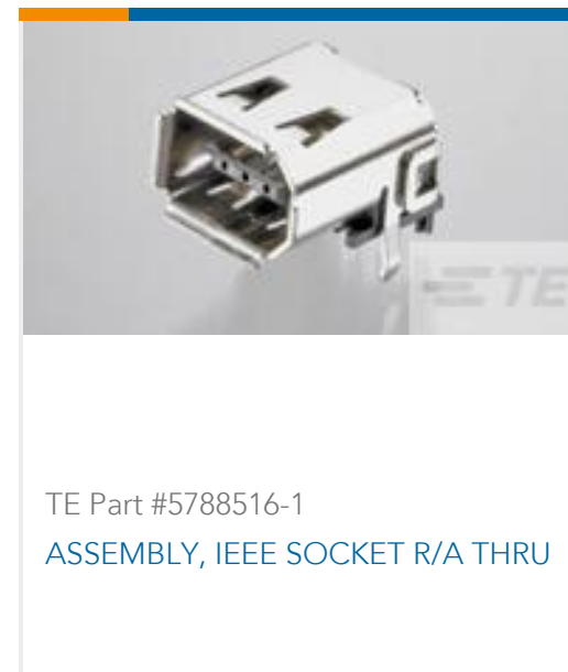
TE Part #5788516-1 ASSEMBLY, IEEE SOCKET R/A THRU