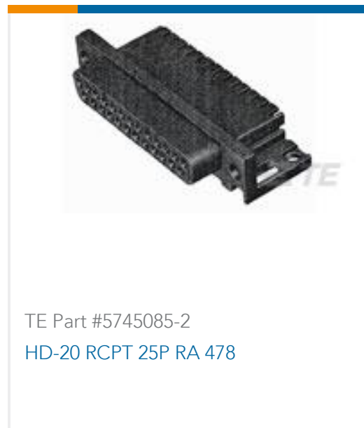
TE Part #5745085-2 HD-20 RCPT 25P RA 478