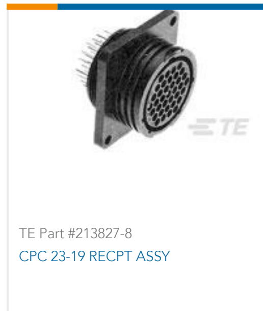
TE Part #213827-8 CPC 23-19 RECPT ASSY