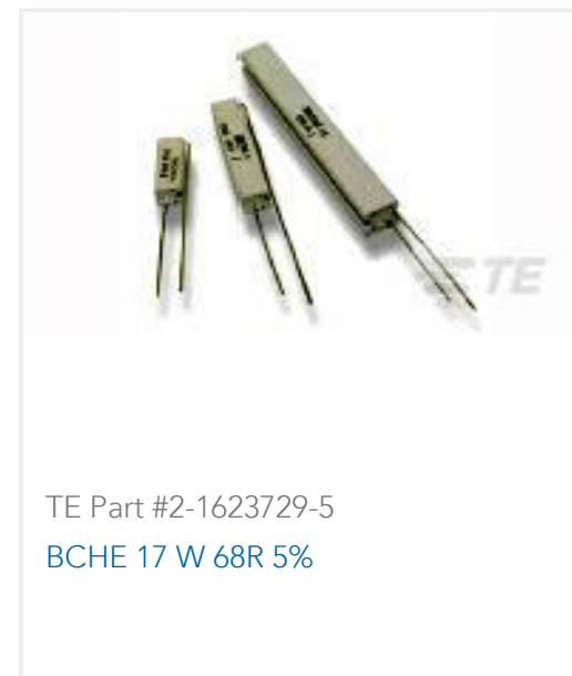
TE Part #2-1623729-5 BCHE 17 W 68R 5%