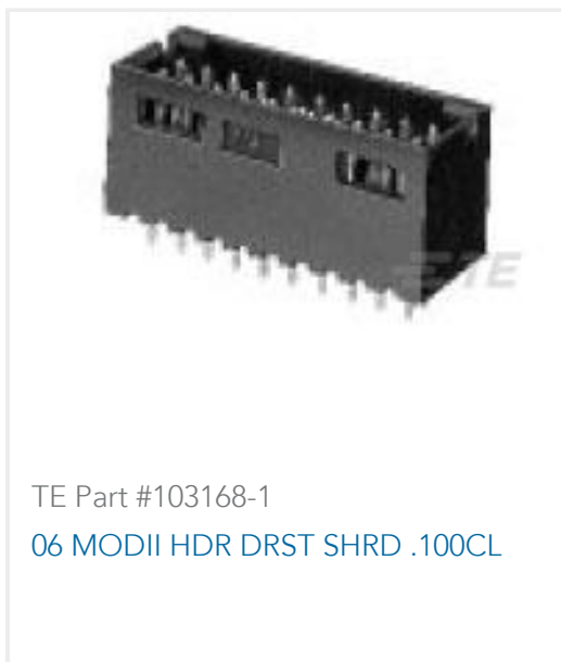
TE Part #103168-1 06 MODII HDR DRST SHRD .100CL