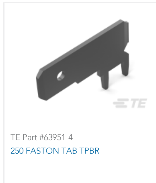
TE Part #63951-4 250 FASTON TAB TPBR