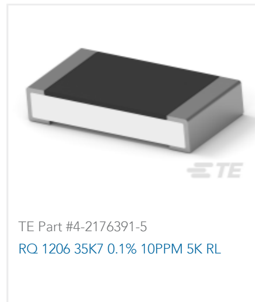
TE Part #4-2176391-5 RQ 1206 35K7 0.1% 10PPM 5K RL