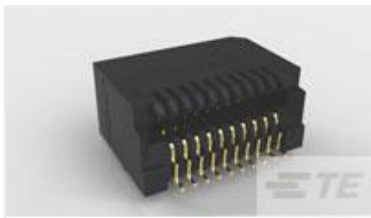
TE Part #1888247-1 20 POS SMT CONN, SFP/SFP+, 30A