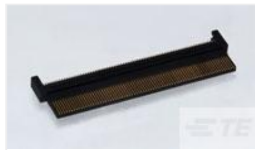
TE Part #2057629-1 CFP Module Conn Assy