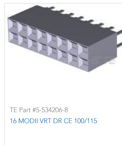
TE Part #5-534206-8 16 MODII VRT DR CE 100/115