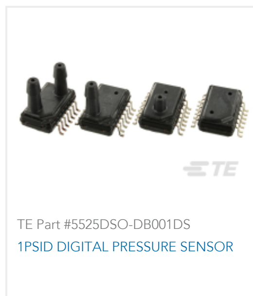
TE Part #5525DSO-DB001DS 1PSID DIGITAL PRESSURE SENSOR