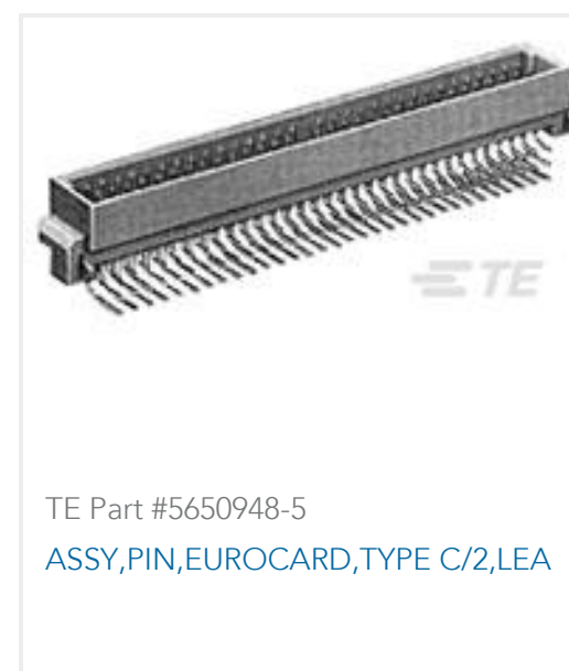
TE Part #5650948-5 ASSY,PIN,EUROCARD,TYPE C/2,LEA