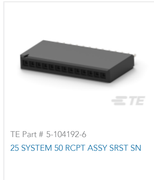
TE Part # 5-104192-6 25 SYSTEM 50 RCPT ASSY SRST SN