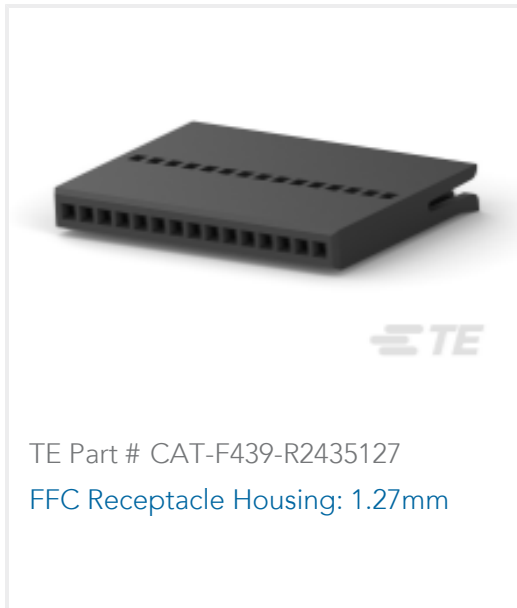
TE Part # CAT-F439-R2435127 FFC Receptacle Housing: 1.27mm