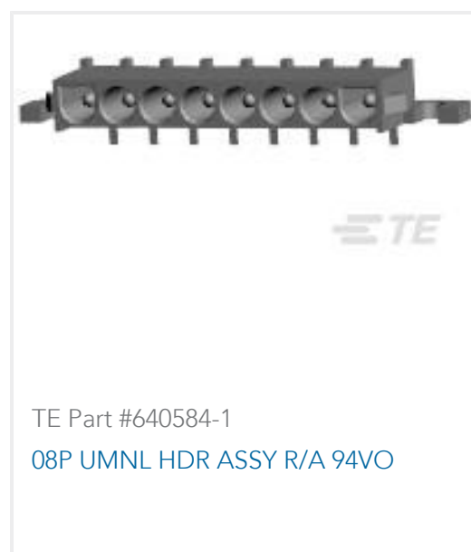
TE Part #640584-1 08P UMNL HDR ASSY R/A 94VO