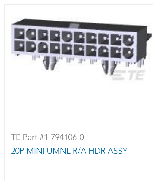
TE Part #1-794106-0 20P MINI UMNL R/A HDR ASSY