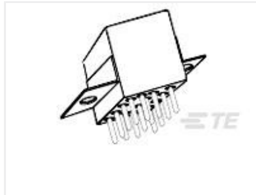
TE Part #1-1617754-7 FCA-410-1620M=M83536/16-020M