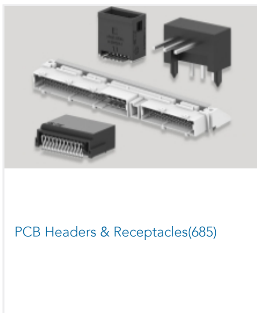
PCB Headers & Receptacles(685)