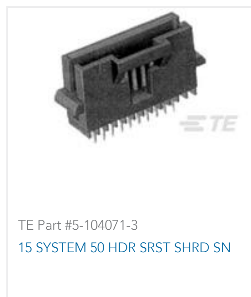
TE Part #5-104071-3 15 SYSTEM 50 HDR SRST SHRD SN