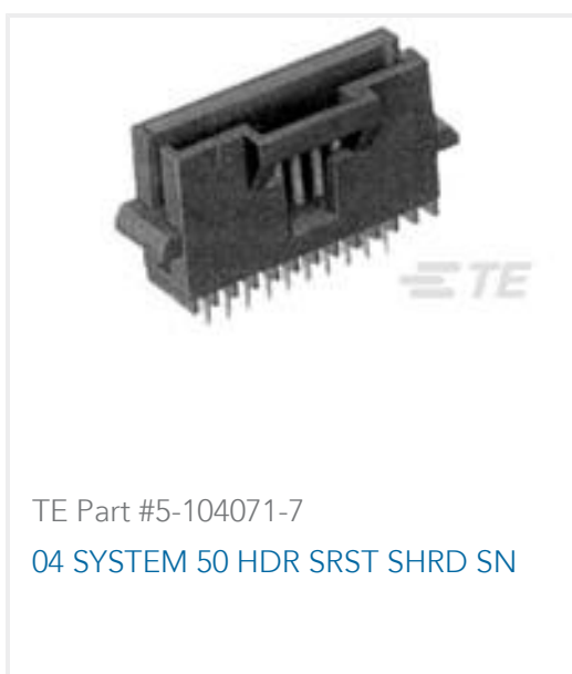
TE Part #5-104071-7 04 SYSTEM 50 HDR SRST SHRD SN