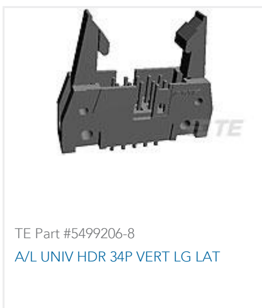
TE Part #5499206-8 A/L UNIV HDR 34P VERT LG LAT