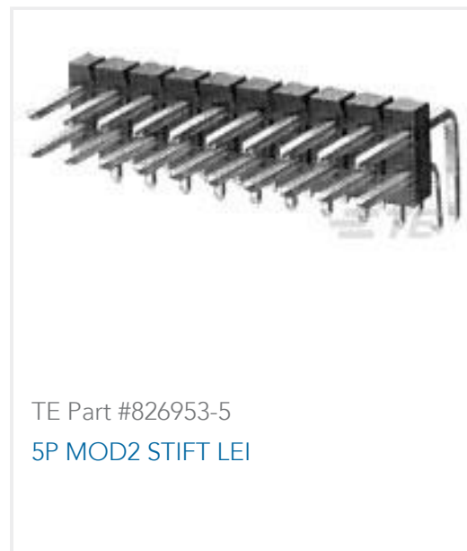
TE Part #826953-5 5P MOD2 STIFT LEI