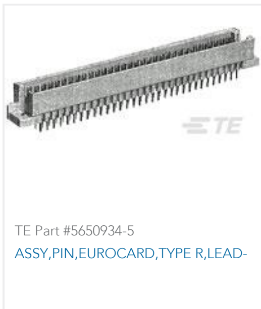
TE Part #5650934-5 ASSY,PIN,EUROCARD,TYPE R,LEAD-