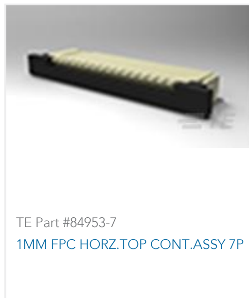
TE Part #84953-7 1MM FPC HORZ.TOP CONT.ASSY 7P