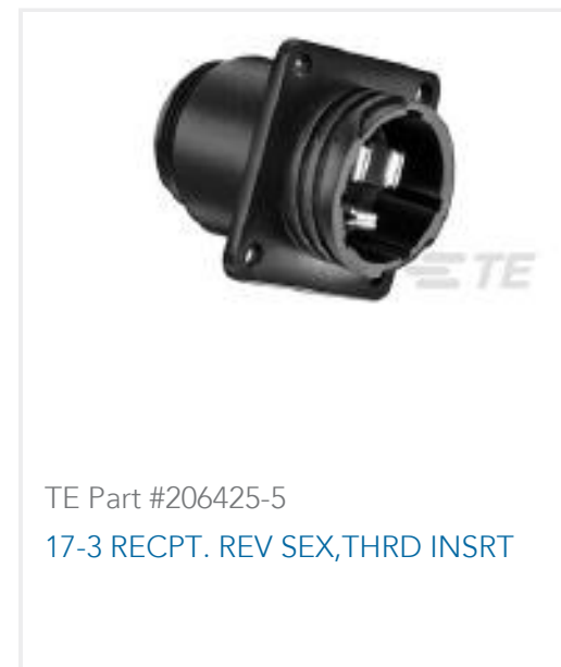
TE Part #206425-5 17-3 RECPT. REV SEX,THRD INSRT