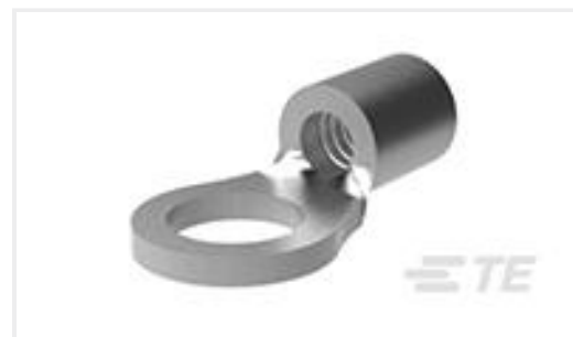
TE Part #8-33458-2 TERM,SOLIS R 12-10 1/4