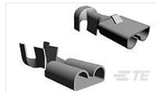
TE Part #42100-1 FF 250 REC 18-14AWG BR