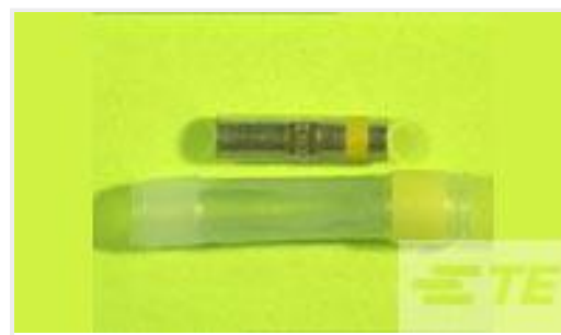
TE Part #650087-000 D-436-26