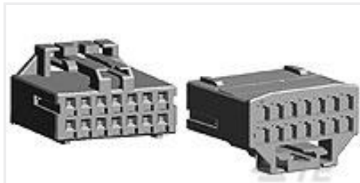
TE Part #1-936124-2 14POS MQS REC