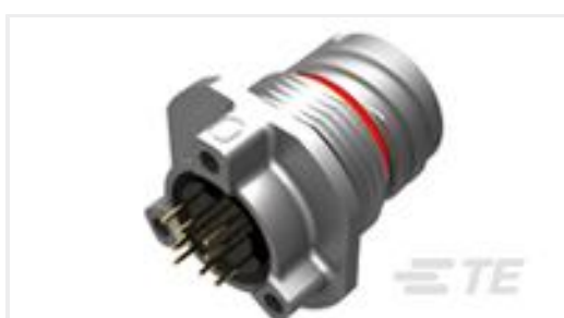
TE Part #2102351-1 CeeLok FAS-T, Receptacle Kit, PCB, Ni