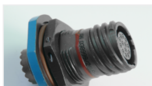
TE Part #YDTS24W09-35SAV001 RECP ASSY