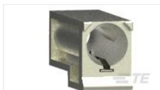
TE Part #1-1469492-8 MULTIGIG RT 9MM GUIDE/ESD 315 DEG