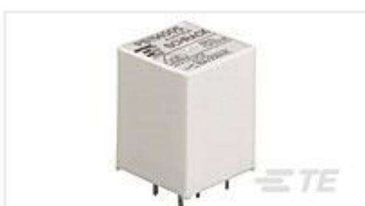
TE Part #9-1415029-1 PB114024