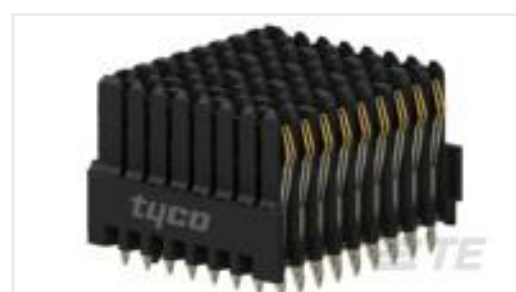
TE Part #1410186-1 MULTIGIG RT T2 .8" BP H-LFT DEG