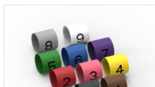
TE Part #0068670001 TRSA-1019/G/1/3