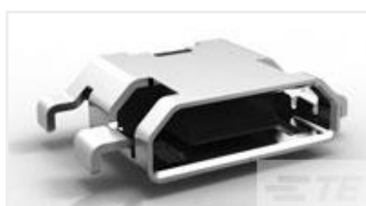
TE Part #2134441-2 MICRO USB, TYPE B, MIDMOUNT, REVERSE