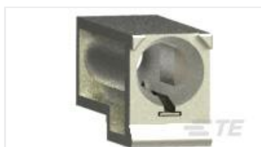
TE Part #1-1469492-7 MULTIGIG RT 9MM GUIDE/ESD 270 DEG