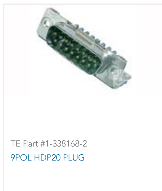
TE Part #1-338168-2 9POL HDP20 PLUG