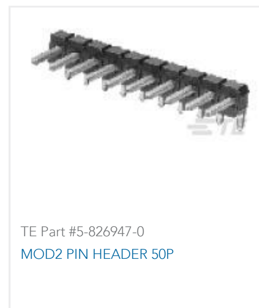
TE Part #5-826947-0 MOD2 PIN HEADER 50P