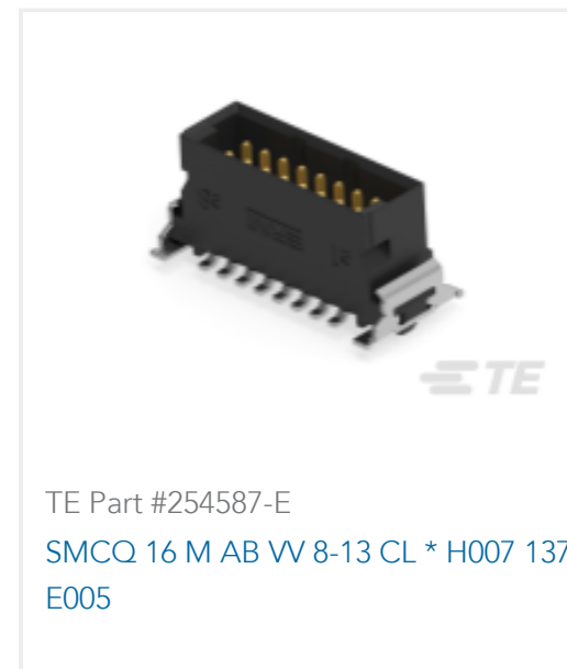
TE Part #254587-E SMCQ 16 M AB VV 8-13 CL * H007 137 E005