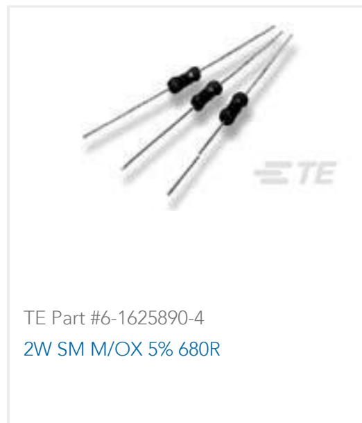
TE Part #6-1625890-4 2W SM M/OX 5% 680R