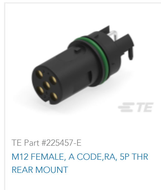
TE Part #225457-E M12 FEMALE, A CODE, RA, 5P THR REAR MOUNT