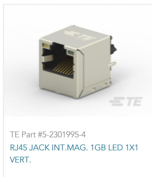
TE Part #5-2301995-4 RJ45 JACK INT.MAG. 1GB LED 1X1 VERT.