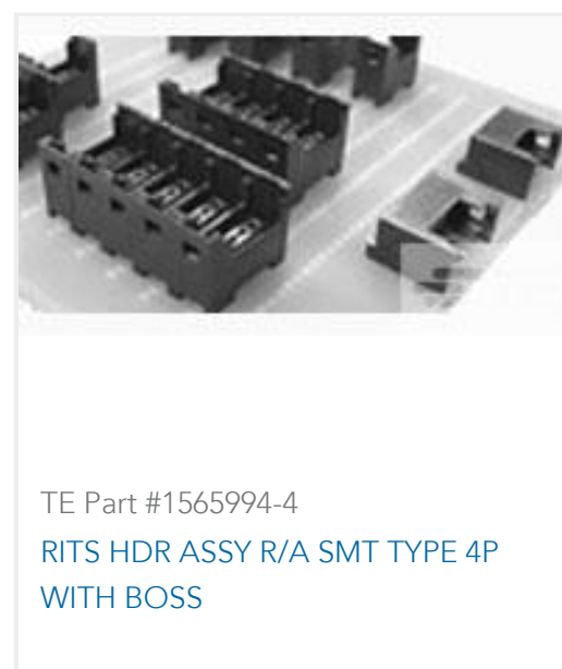
TE Part #1565994-4 RITS HDR ASSY R/A SMT TYPE 4P WITH BOSS