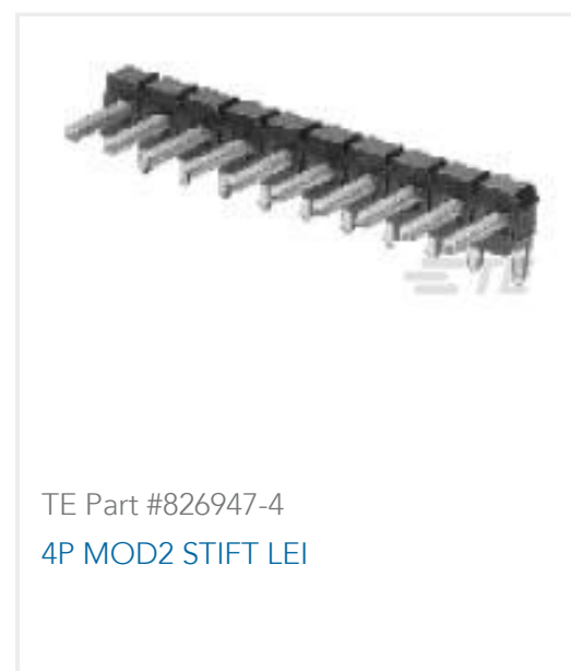
TE Part #826947-4 4P MOD2 STIFT LEI