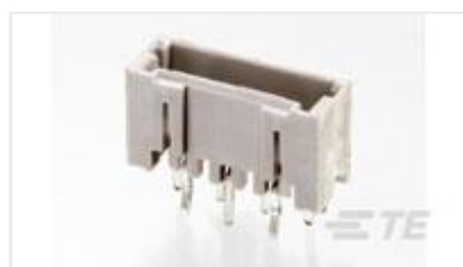
TE Part #1-292207-0 MINI CT SGL DIP V 10P NAT