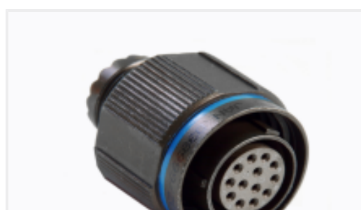
TE Part #YDTS26W15-19SNV001 PLUG ASSY