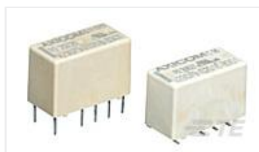
TE Part #1393788-3 V23079A1001B301