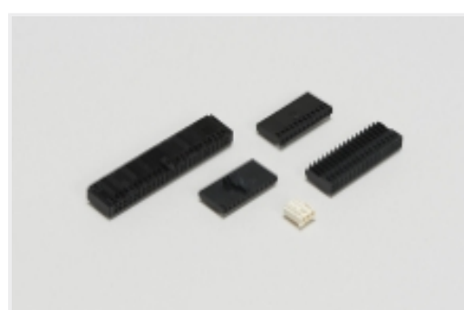
Wire-to-Board Connector Assemblies & Housings(11)