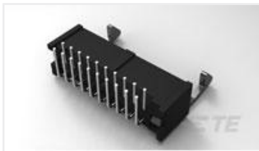
TE Part #1761607-6 IDC LOW PRO HDR 16P RA LG LAT BLK