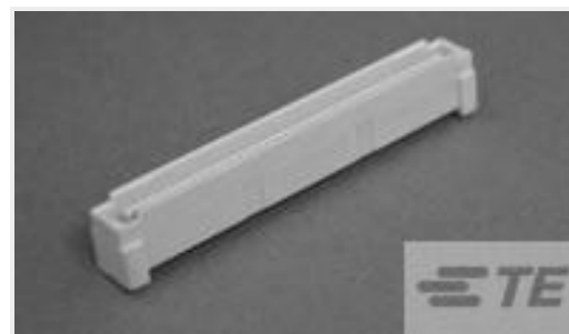
TE Part #5179031-2 0.8FH,P08H.5,060,08/Sn,TU