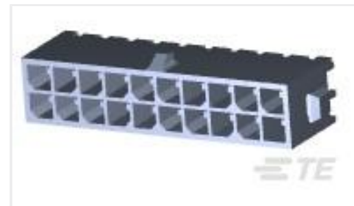
TE Part #5-794632-0 20P MICRO MNL ASSY,VRT,HDR,LF