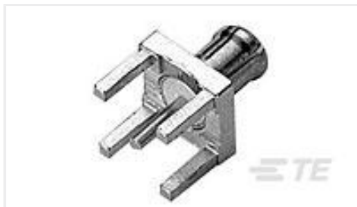
TE Part #1061015-1 5863 0000 10,OSX PCB PLUG