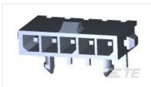
TE Part #2-1445098-5 MICRO MNL HDR ASSY S/ROW AU LF