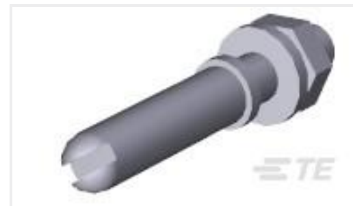
TE Part #200389-2 GUIDE PIN KIT