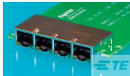
TE Part #1888251-2 Low Profile,RJ45,1x4,Bi-Color