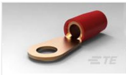
TE Part #324082 TERMINAL,T-N R 8 1/4