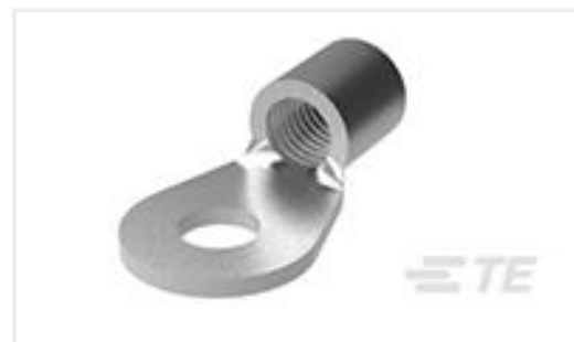
TE Part #33466 TERMINAL,SOLIS R 6 5/16