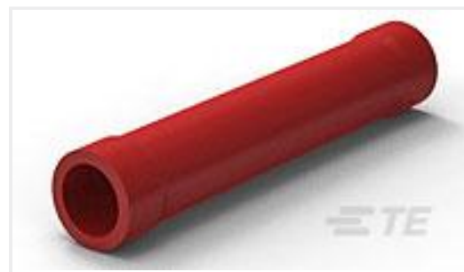
TE Part #34070 PG BUTT SPLC 22-16COMM22-18MIL