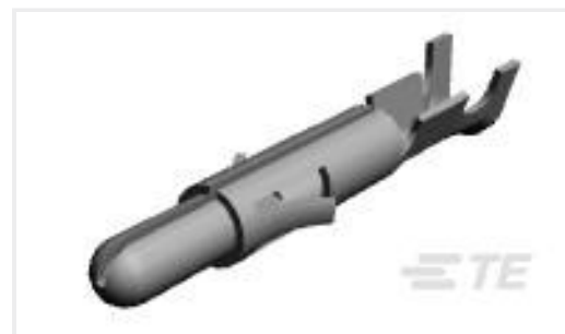
TE Part #350561-1 UMNL PIN 24-18 .0126 PTPBR