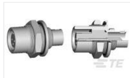
TE Part #1-1437720-4 T01-0590-PS05