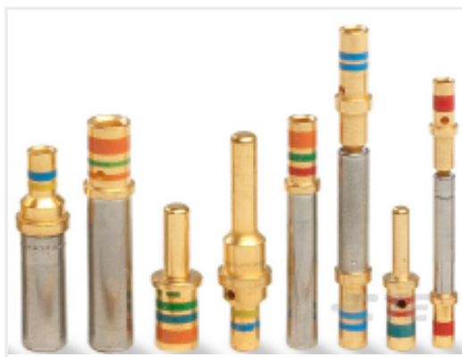
TE Part #0660-206-1282 CONT PIN