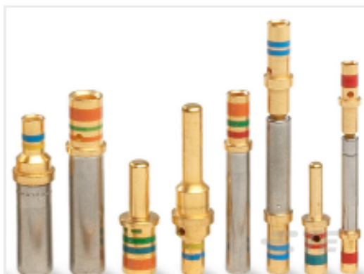
TE Part #0641-2-1631L CONT PIN