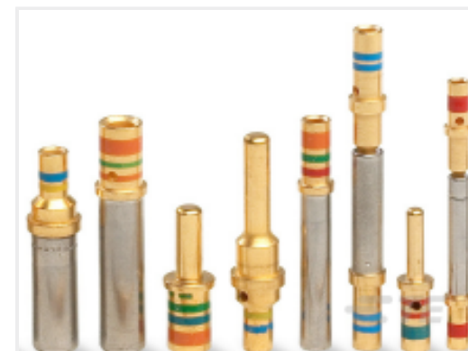
TE Part #38943-20L CONT SOC ASSY