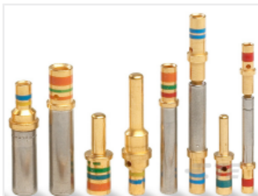
TE Part # 0660-206-1631L CONT PIN