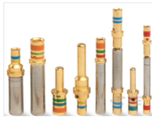
TE Part #0660-206-1631L CONT PIN