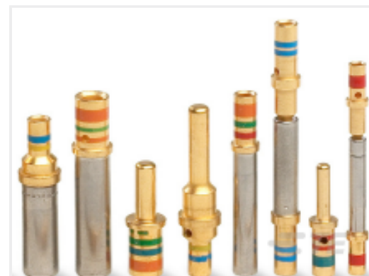
TE Part #0641-1-2031L CONT PIN