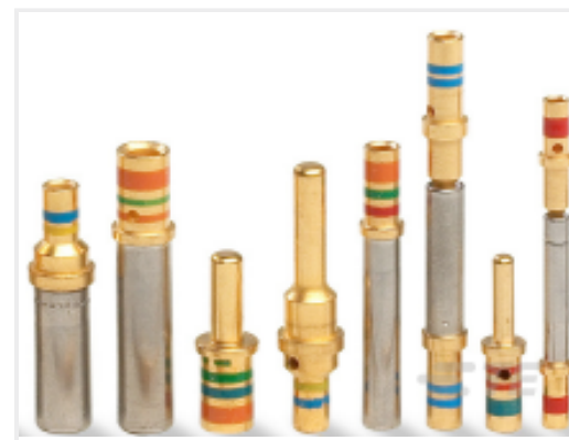
TE Part #0662-207-1282 CONT SOC ASSY