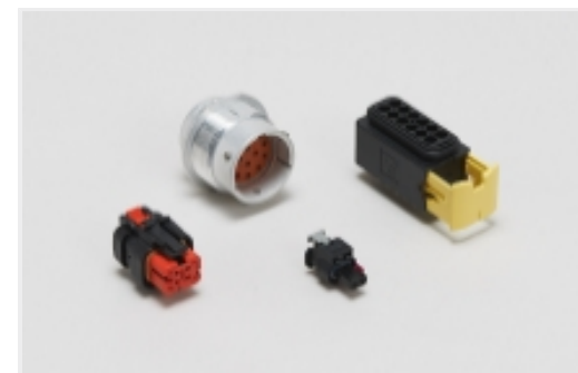
Automotive Housings (306)