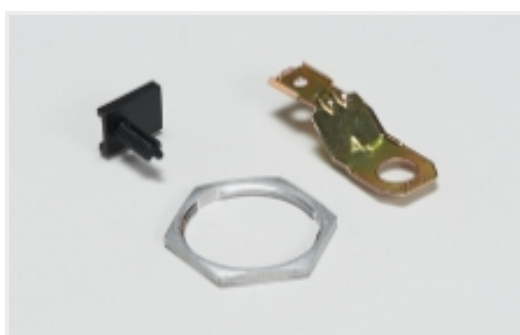
Other Automotive Connector Accessories (2)