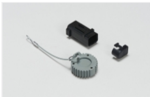
Automotive Connector Caps & Covers (9)