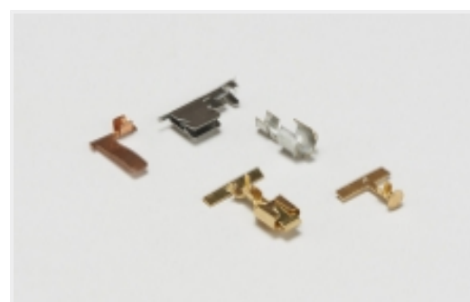
Special Purpose Terminals (2)