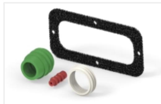
Connector Seals & Cavity Plugs (8)