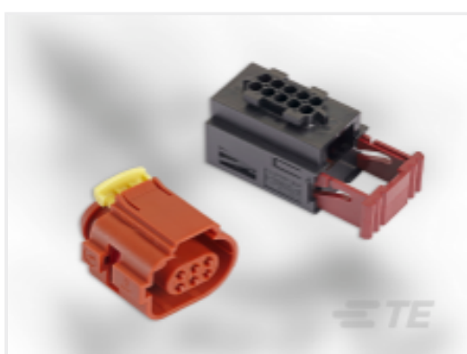
TE Part #1-967622-3 Timer Connector Housing