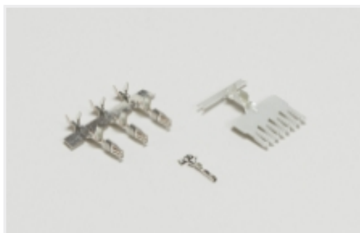
Busbars & Terminals (1)