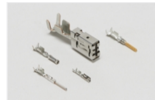
Automotive Terminals (153)