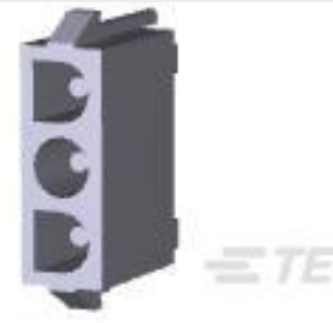
TE Part #641966-1 03P UMNL PIN HDR ASSY 94VO