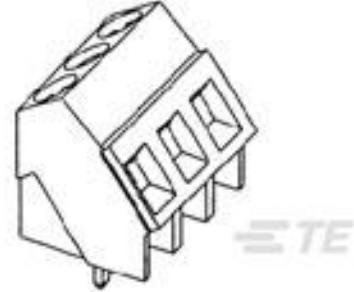
TE Part #796689-5 TERMI-BLOK PCB MOUNT 5P.