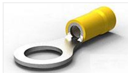
TE Part #34173 TERMINAL,PG R 12-10 3/8