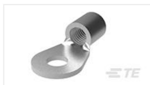
TE Part #321868 TERMINAL SOLIS RING 1/0 3/8