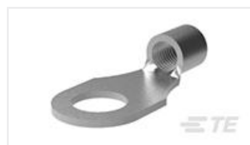
TE Part #322870 TERMINAL,SOLIS R 2 5/16