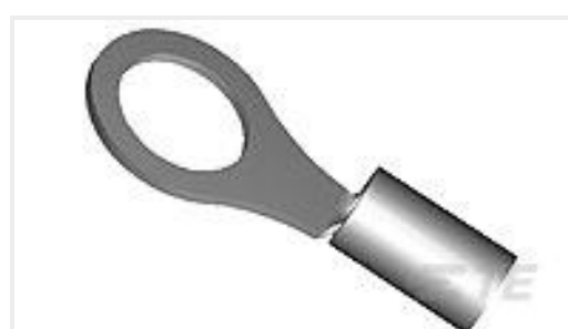
TE Part #321869 TERMINAL,SOLIS R 2/0 1/4