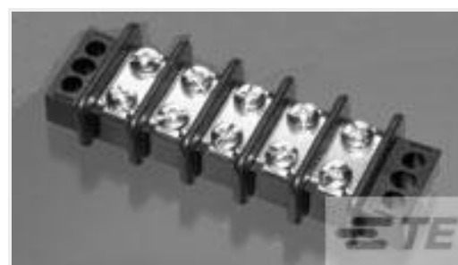
TE Part #1546310-6 6P .563" DR BARRIER STRIP