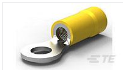
TE Part #34854 TERMINAL,PG R 12-10 10