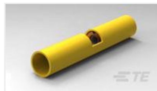
TE Part #320570 SPLICE BUTT PIDG 12-10