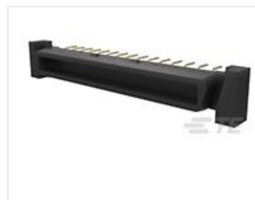
TE Part #5917629-5 AMP FH REC V 120P H-9 SIF