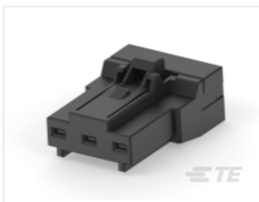
TE Part #3-2134249-3 D3900S 7.5MM PITCH REC ASSY 3P BLACK Z