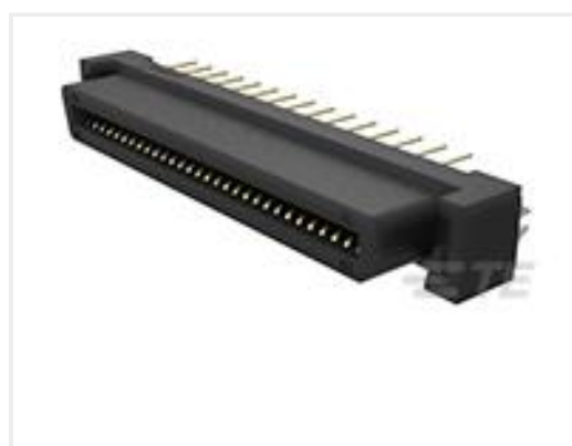
TE Part #3-5175475-5 CHAMP 050 B/B REC V W/LEG 40P