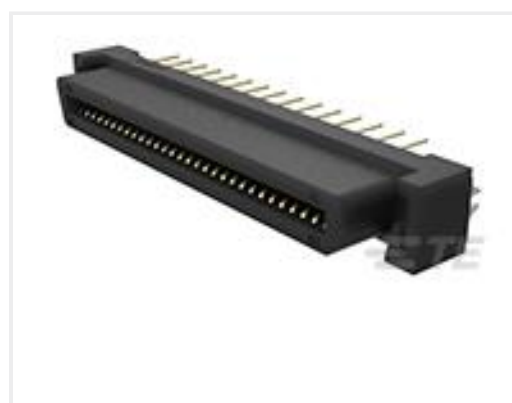
TE Part #3-5175475-7 CHAMP 050 B/B REC V W/LEG 60P