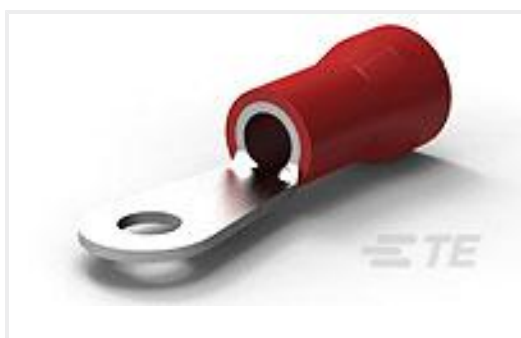
TE Part #52263-2 TERMINAL R PG 8 10