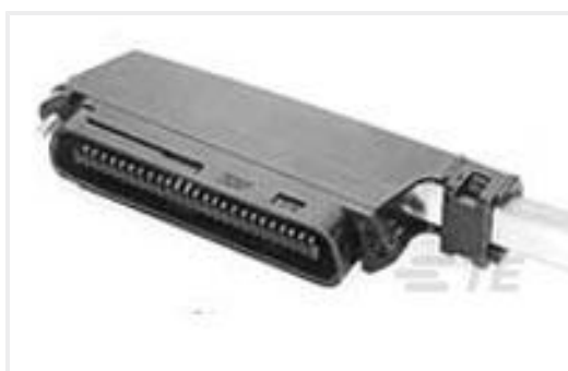
TE Part #1-5229912-1 KIT, PLUG, 50 POS, B SLOT