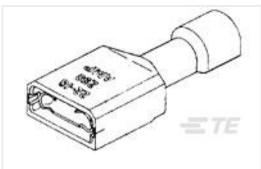
TE Part #3-520140-4 ULTRA-FAST 250 ASY REC 16-14 AWG TPBR