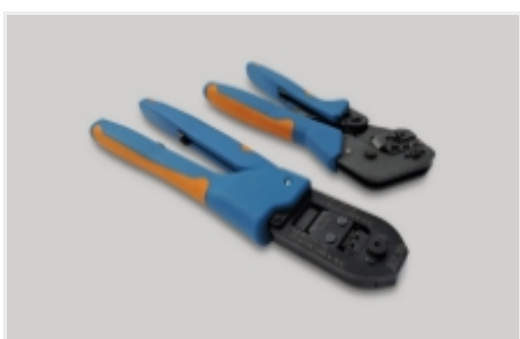
Hand Crimping Tools(2)