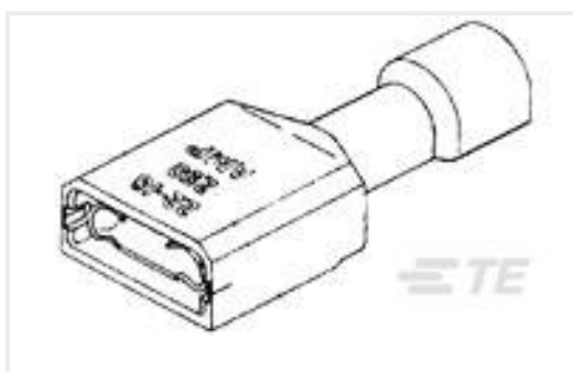
TE Part #2-520263-4 ULTRA-FAST 250 ASY REC 22-18 TPBR