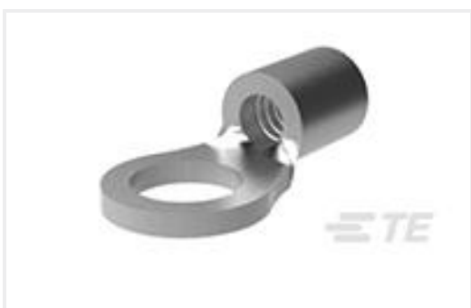
TE Part #35668 TERMINAL,SOLIS R 4 1/2