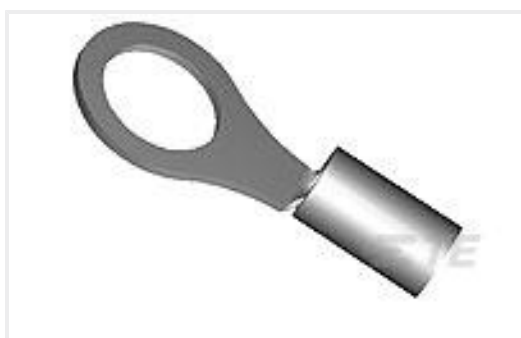
TE Part #30927 TERMINAL,DG R 16-14 8