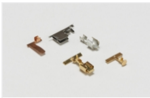
Special Purpose Terminals(1)