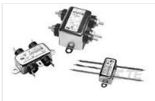
TE Part #6609020-6 3EB3=F7103 S0