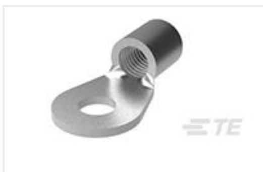
TE Part #36917 TERMINAL,SOLIS R 1/0 3/8