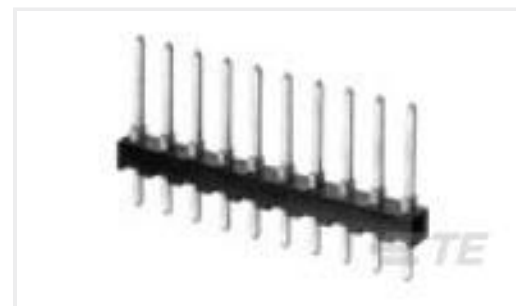
TE Part #825440-5 MOD 2 PINHDR 2X05P.