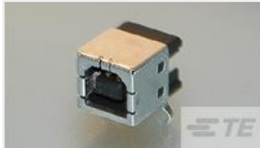
TE Part #292304-1 STD USB TYPE B, R/A, T/H