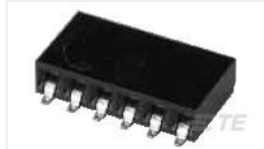
TE Part #147721-3 04 MODII HORZ SR SFMNT 30AU