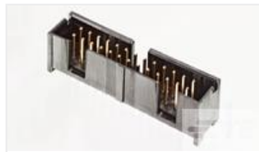
TE Part #5103308-6 A/L LOW PRO HDR 26P VERT BLACK