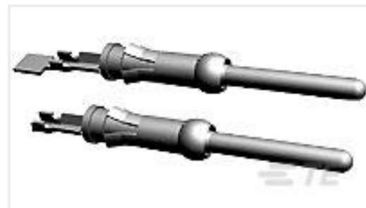
TE Part #1-66361-2 III+ PIN,18-14,TIN,LP