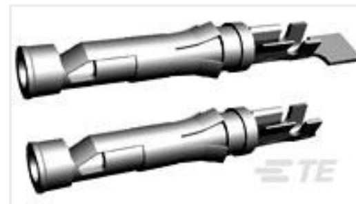
TE Part #1-66360-2 III+ SKT,18-14,TIN,LP