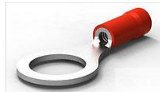
TE Part #34151 PG R 22-16 COMM 22-18 MIL 5/16