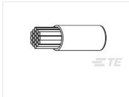
TE Part #7286093002 FLHTC0311-1.00-6