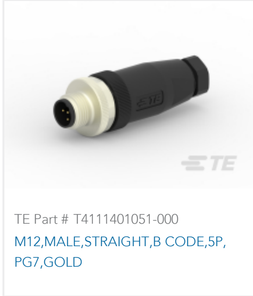
TE Part # T4111401051-000 M12,MALE,STRAIGHT,B CODE,5P, PG7,GOLD