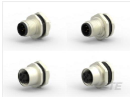
TE Part #T4131412051-000 M12 Panel Mount Solder Cups