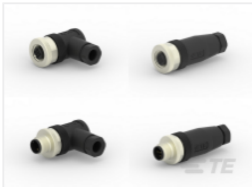
TE Part #T4111402051-000 M12 Field Installable Unshielded