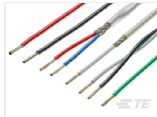
TE Part #CD67143001 FLT0111-1.50-5