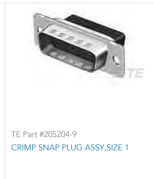
TE Part #205204-9 CRIMP SNAP PLUG ASSY,SIZE 1