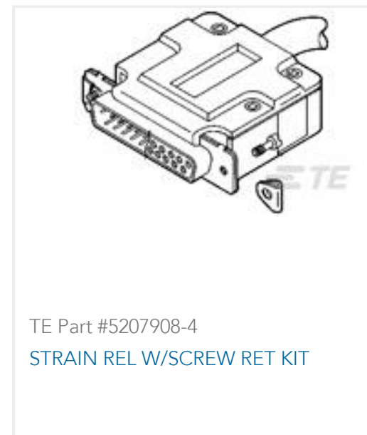
TE Part #5207908-4 STRAIN REL W/SCREW RET KIT