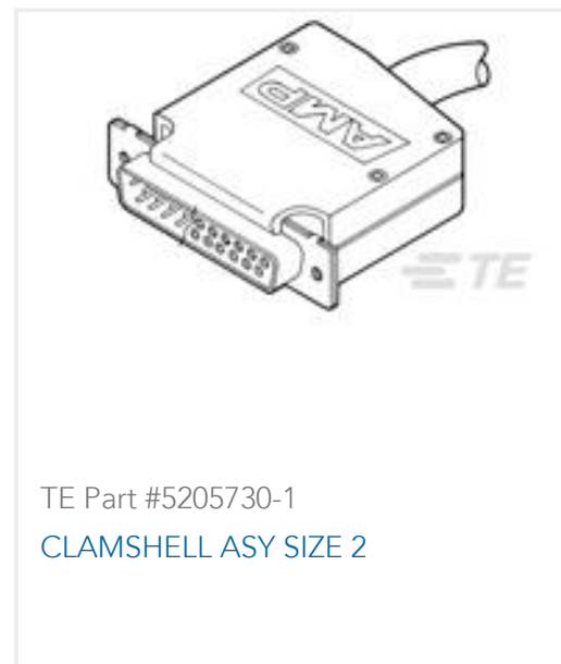
TE Part #5205730-1 CLAMSHELL ASY SIZE 2