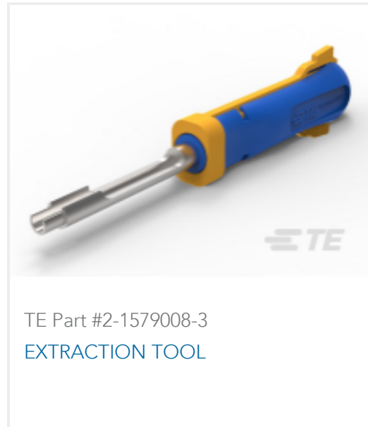
TE Part #2-1579008-3 EXTRACTION TOOL