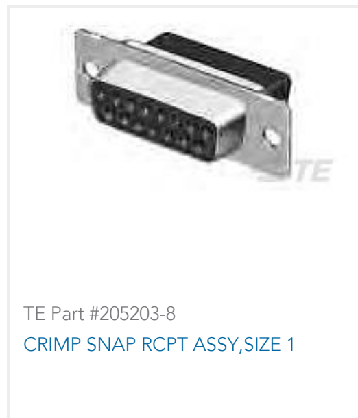
TE Part #205203-8 CRIMP SNAP RCPT ASSY,SIZE 1