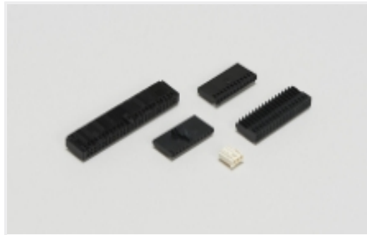
Wire-to-Board Connector Assemblies & Housings(141)