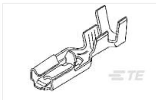
TE Part #1742354-1 PL 250 REC 16-18AWG PTBR