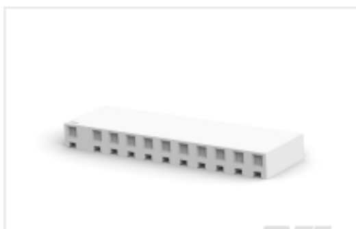
TE Part #1-1744074-1 11P SL LID HSG W/O RAMP SPECIAL CL