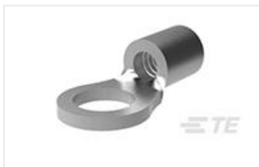
TE Part #2-35771-1 TERMINAL, SOLIS R 12-10 10