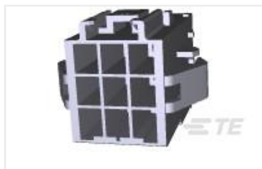
TE Part #177911-1 POWER DBL LOCK CAP HSG P/M 9P