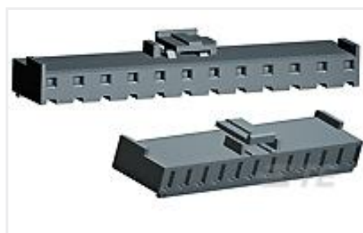
TE Part #1744036-5 05P ECONOMY POWER .200 CL HSG