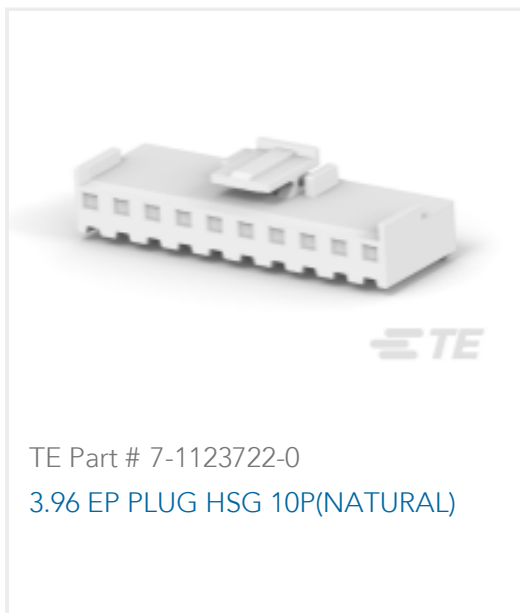
TE Part # 7-1123722-0 3.96 EP PLUG HSG 10P(NATURAL)