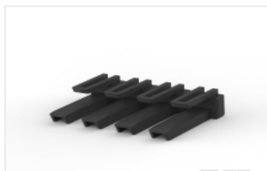
TE Part #1744544-4 EP II TPA 04P, BLACK