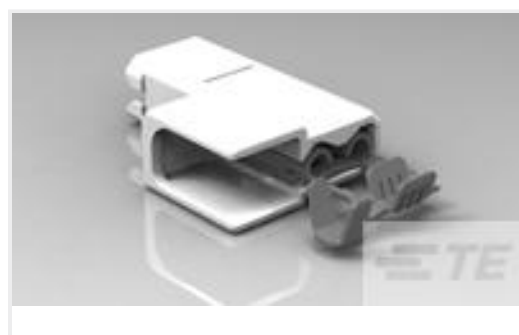
TE Part #521600-2 ULTRA-POD 187 ASY REC 22-18 AWG TPBR