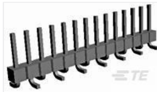
TE Part #1241150-5 5P MOD II BREAK AWAY HDR, SMD, BLISTER