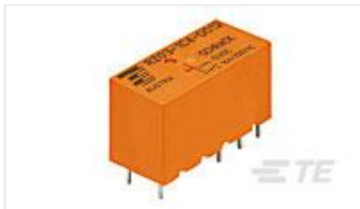
TE Part #5-1415899-4 RZ03-1C3-D012