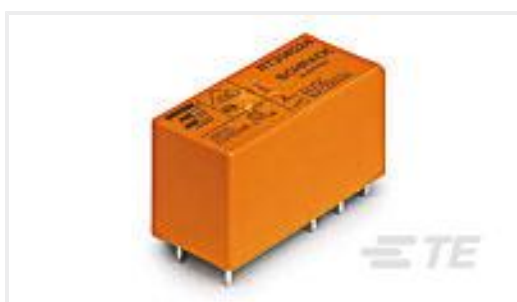
TE Part #5-1393243-6 RT424F24