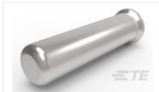
TE Part #5380598-3 RCR SN-SPR SN-CUP 018-040