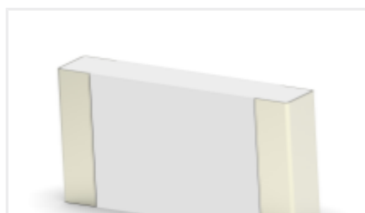
TE Part #4-2176245-8 CRGS1206 5% 8K2