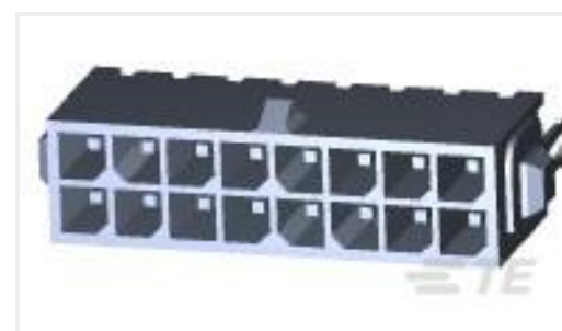
TE Part #4-794680-6 16P MICRO MNL ASSY,VRT,THRU LF