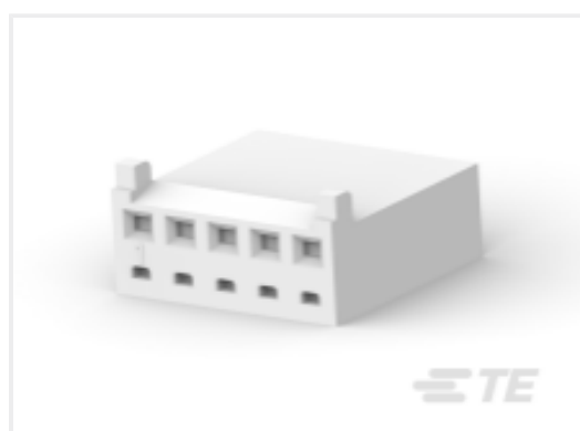
TE Part # 1375820-5 CST-100 II HOUSING 5 POS