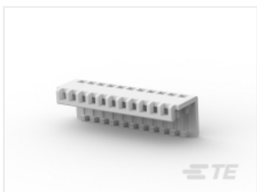
TE Part # CAT-104MTA-NYLCC Nylon PCB Connector Covers: 2.54 mm, MTA 100