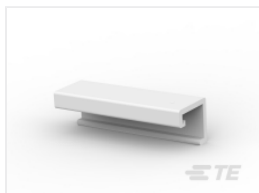
TE Part # CAT-104MTA-PLSCC Polyester PCB Connector Covers: 2.54 mm, MTA 100