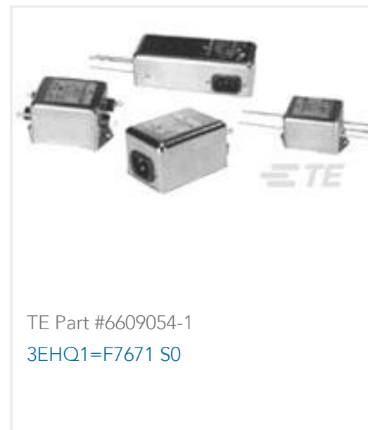
TE Part #6609054-1 3EHQ1=F7671 S0