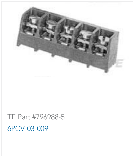
TE Part #796988-5 6PCV-03-009