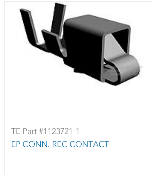
TE Part #1123721-1 EP CONN. REC CONTACT