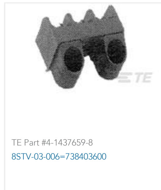
TE Part #4-1437659-8 8STV-03-006=738403600