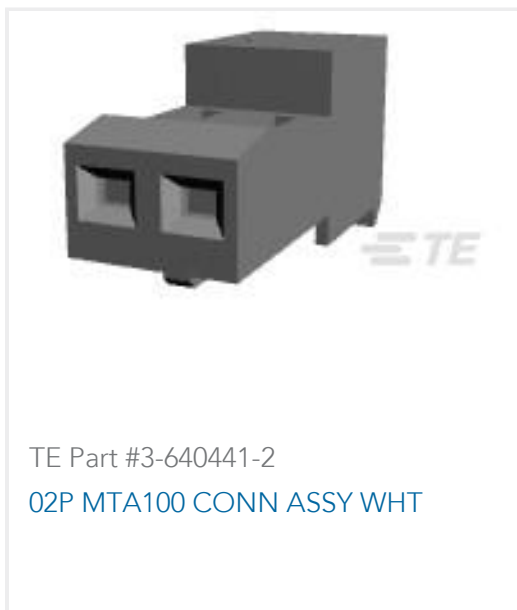
TE Part #3-640441-2 02P MTA100 CONN ASSY WHT