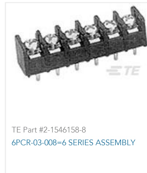
TE Part #2-1546158-8 6PCR-03-008=6 SERIES ASSEMBLY