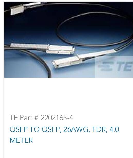
TE Part # 2202165-4 QSFP TO QSFP, 26AWG, FDR, 4.0 METER