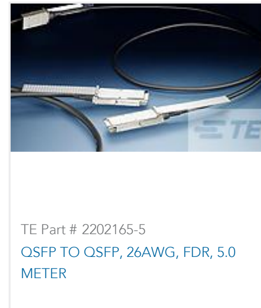
TE Part # 2202165-5 QSFP TO QSFP, 26AWG, FDR, 5.0 METER