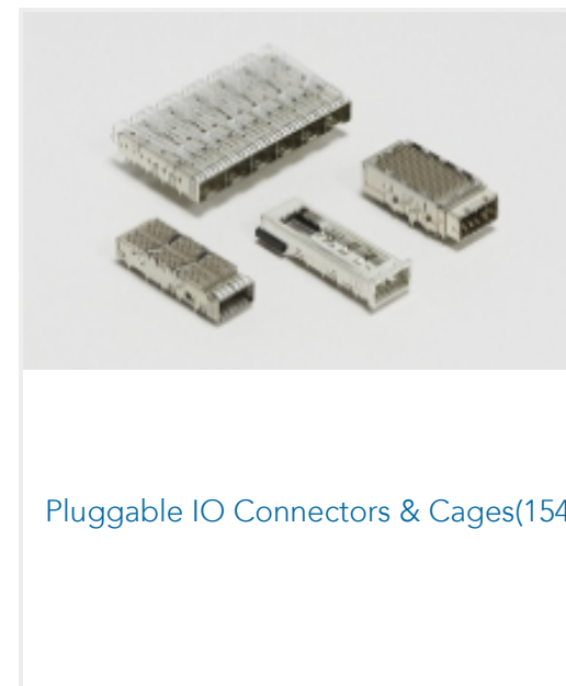
Pluggable IO Connectors & Cages(154)