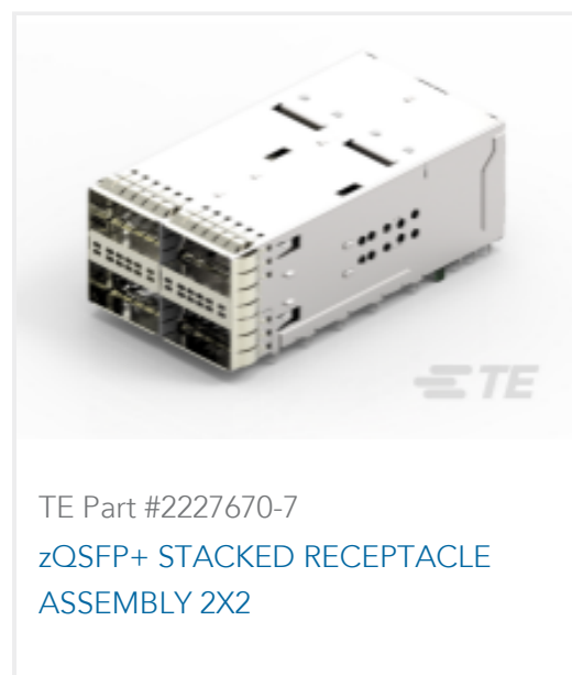
TE Part #2227670-7 zQSFP+ STACKED RECEPTACLE ASSEMBLY 2X2