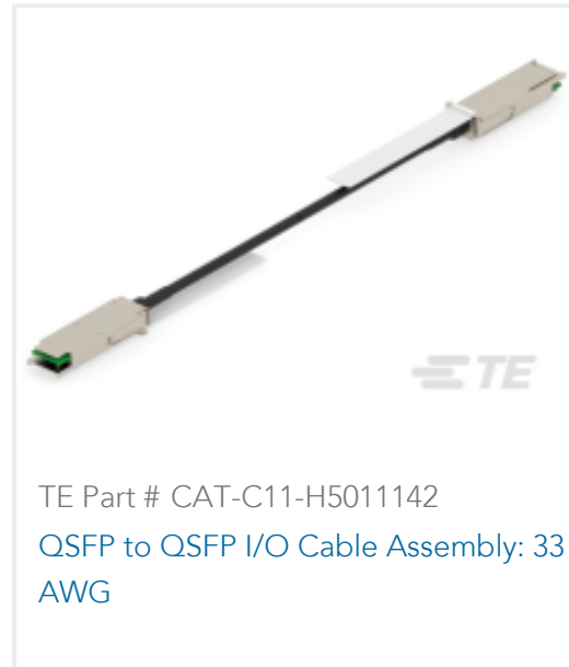
TE Part # CAT-C11-H5011142 QSFP to QSFP I/O Cable Assembly: 33 AWG