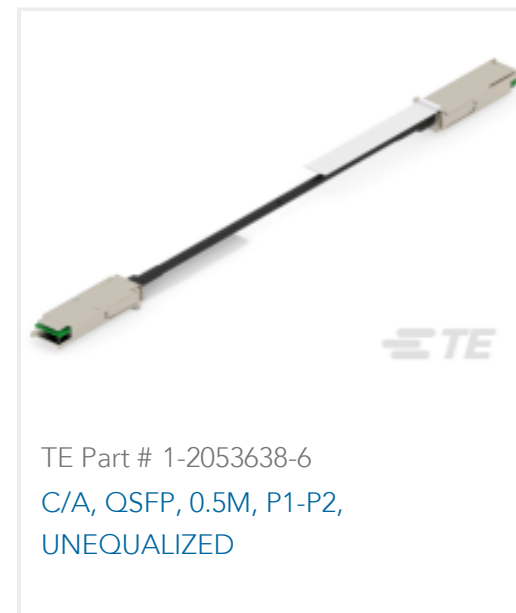
TE Part # 1-2053638-6 C/A, QSFP, 0.5M, P1-P2, UNEQUALIZED