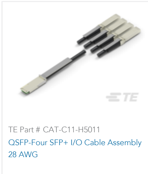
TE Part # CAT-C11-H5011 QSFP-Four SFP+ I/O Cable Assembly 28 AWG