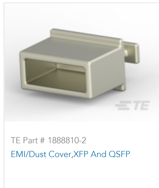
TE Part # 1888810-2 EMI/Dust Cover, XFP And QSFP