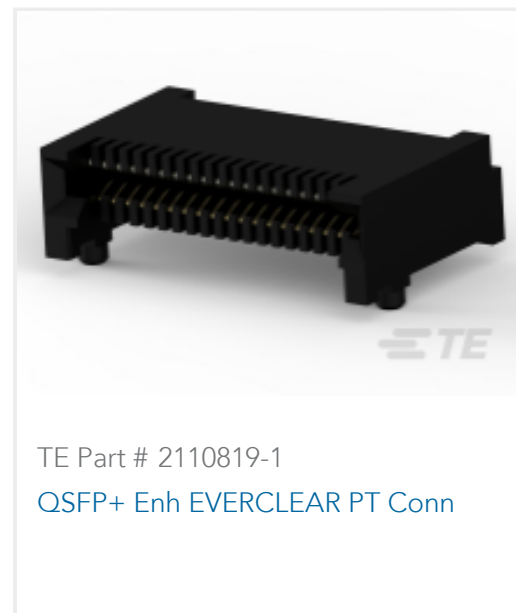
TE Part # 2110819-1 QSFP+ Enh EVERCLEAR PT Conn