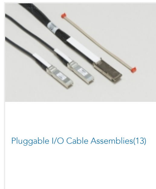
Pluggable I/O Cable Assemblies(13)