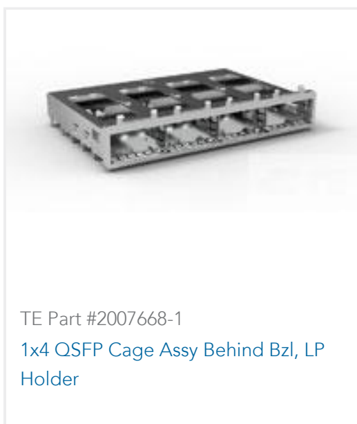
TE Part #2007668-1 1x4 QSFP Cage Assy Behind Bzl, LP Holder