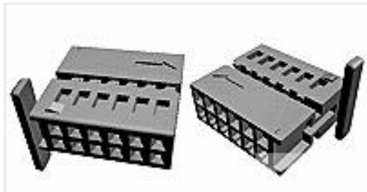
TE Part #968473-1 12POS MOS REC