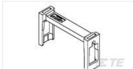
TE Part #3-100103-4 34P.A/L STRAIN REL.