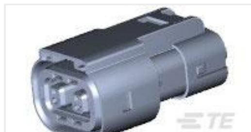
TE Part #2103149-4 PLUG, HVIL ONLY, KEY D, HVA280-2PHI