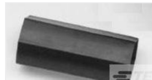
TE Part #134710-000 HRHT-2/3