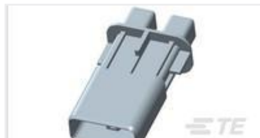
TE Part #2103245-1 Inner Housing, Split Hdr, Key A, HVA280