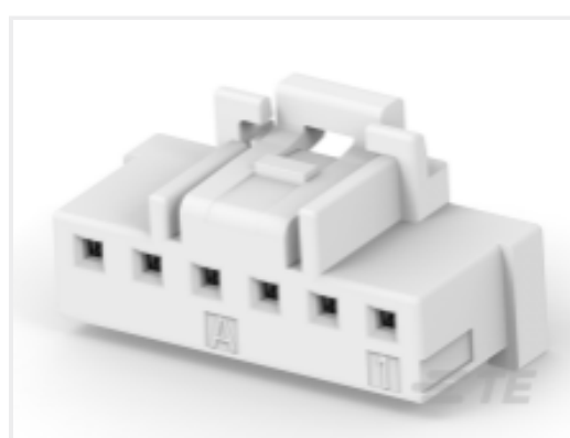
TE Part #1-2232979-6 SGI2.0 PLUG ASSEMBLY 6P, KEY A, NTL