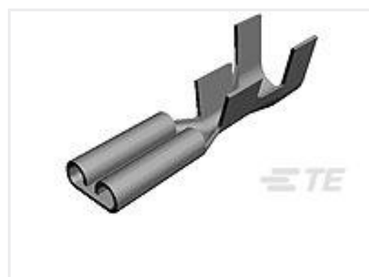
TE Part #62891-1 FF 250 REC 16-12AWG TPBR