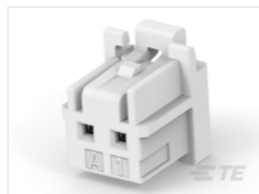
TE Part #1-2232979-2 SGI2.0 PLUG ASSEMBLY 2P, KEY A, NTL