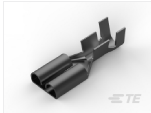
TE Part # 170258-2 FF 250 REC 14-12AWG TPBR REREELING