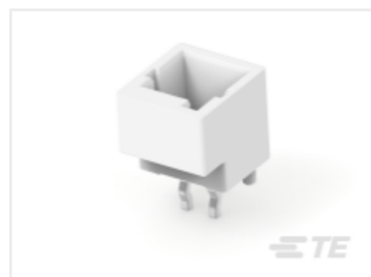
TE Part #1-2232826-2 SGI2.0 header assembly TH 2P,key A, NTL