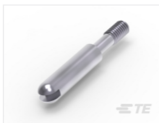
TE Part #T0931000425-000 CODING-PIN-M3-LTM