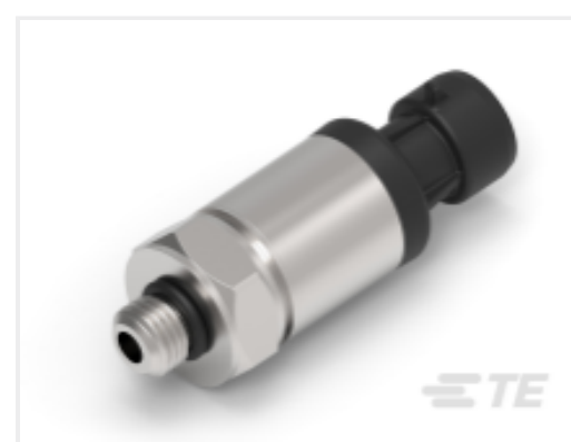
TE Part #20012880-00 PRESS XDCR M3289-000004-05KPG