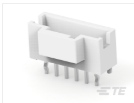
TE Part #1-2232826-6 SGI2.0 header assembly TH 6P,key A, NTL