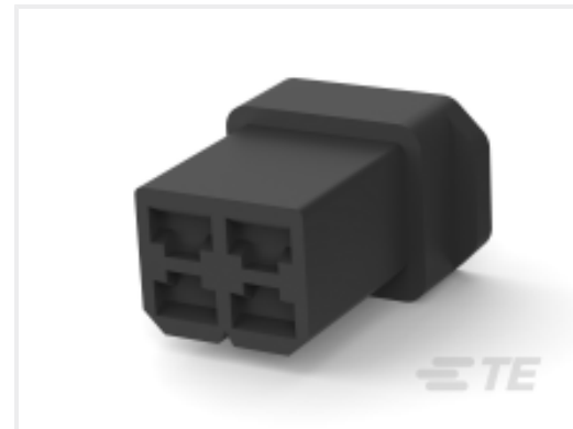
TE Part # 626056-4 FASTIN-ON .110 HOUSING REC PRETO/BLACK