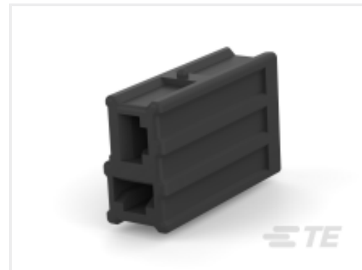
TE Part # 626064-5 ISOLADOR