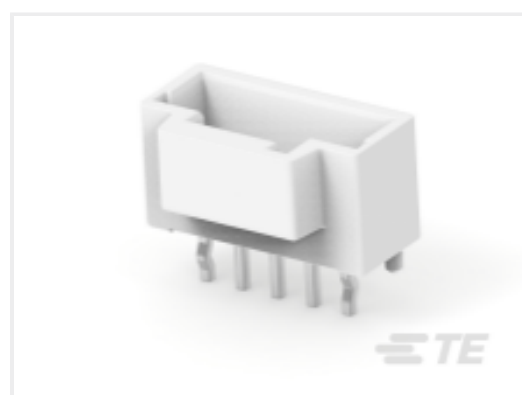
TE Part #1-2232826-5 SGI2.0 header assembly TH 5P,key A, NTL