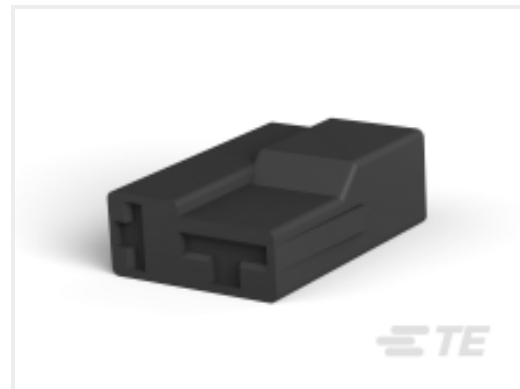
TE Part # 281993-3 FF 250 & 375 REC HSG 2P NYLON BLACK