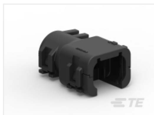
TE Part #2292797-2 AS16,PLUG BACKSHELL KIT,ST,02P, NC12