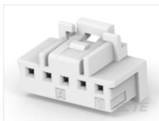
TE Part #1-2232979-5 SGI2.0 PLUG ASSEMBLY 5P, KEY A, NTL