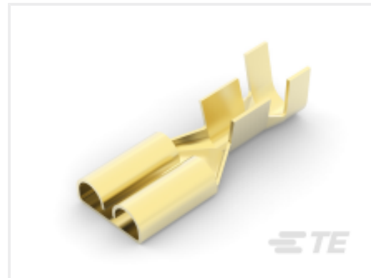
TE Part # 170258-1 FF 250 REC 14-12AWG BR REREELING