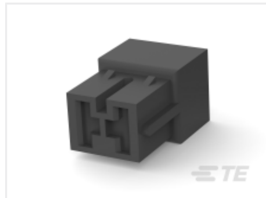
TE Part # 280543-5 FF 250 REC HSG 2P NYLON BLACK