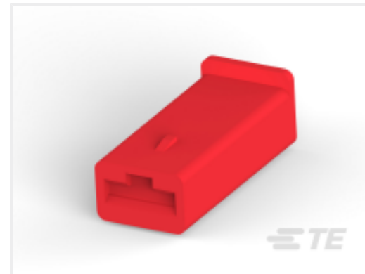
TE Part # 180905-1 FF 250 REC HSG 1P NYLON RED