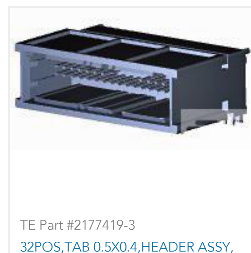
TE Part #2177419-3 32POS,TAB 0.5X0.4,HEADER ASSY, CODA