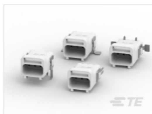
TE Part #1-2834236-2 Miniature Headers, SlimSeal