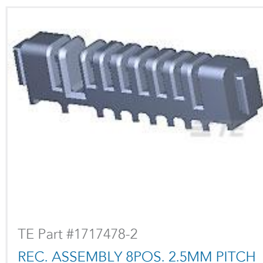
TE Part #1717478-2 REC. ASSEMBLY 8POS. 2.5MM PITCH BATTERY