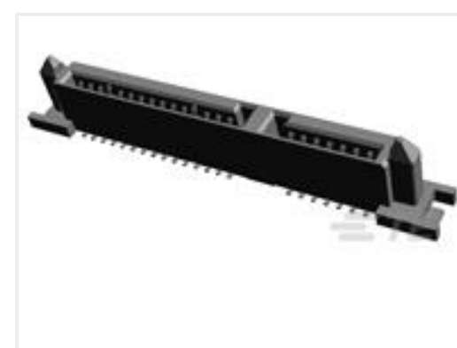
TE Part #1735284-1 SATA BACKPLANE RECEPTACLE, VERTICAL, SMT