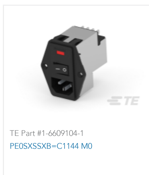
TE Part #1-6609104-1 PE0SXSSXB=C1144 M0