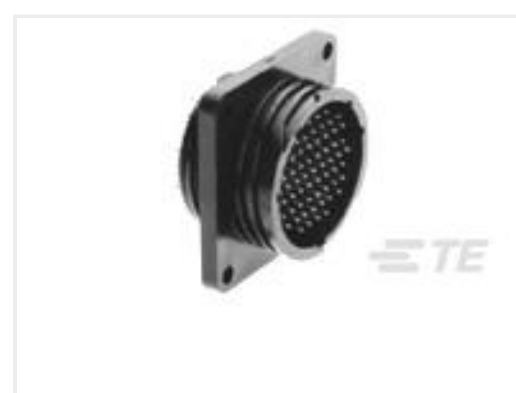
TE Part #1-206455-2 23-63 SZ CPC PSTD PIN RECPT LF