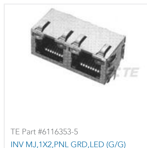
TE Part #6116353-5 INV MJ,1X2,PNL GRD,LED (G/G)