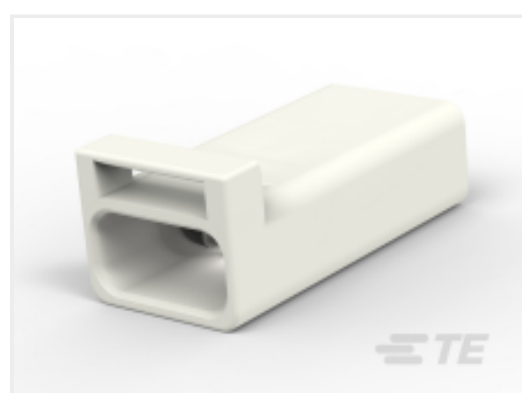
TE Part #1-2834075-2 2P REC, MINIATURE WATERPROOF CONN.WHITE