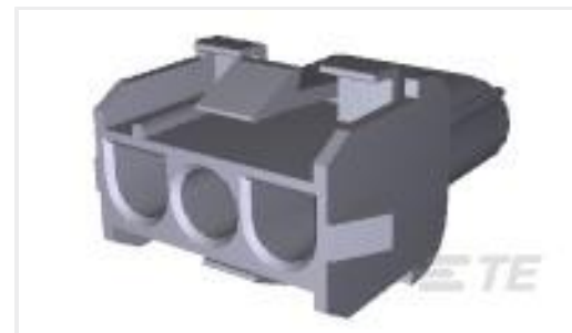
TE Part #1-480701-0 03P UMNL CAP HSG NATL