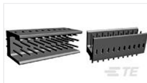
TE Part #826469-5 2X5P MOD II SHROUDED HEADER, ST