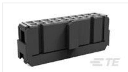
TE Part #1658621-8 34 NOVO MIL/CTR 15DP,LEAD FREE