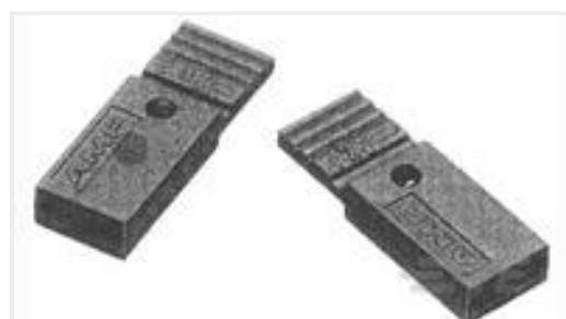
TE Part #881545-2 SHUNT LP W/HANDLE 2 POS 30AU