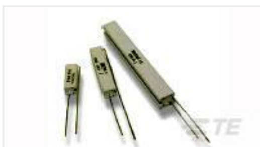
TE Part #3-1623732-4 BCHE 7 W 3K3 5%