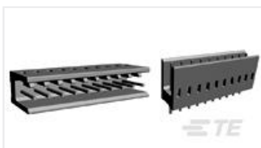
TE Part #826467-4 4P MOD II SHROUDED HEADER, ST