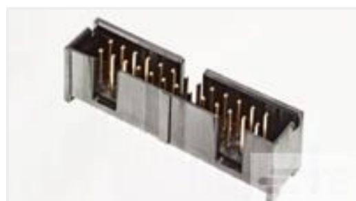
TE Part #1-5103309-0 A/L LOW PRO HDR 50P VERT BLACK