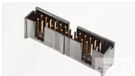
TE Part #5103308-5 A/L LOW PRO HDR 20P VERT BLACK BLUE