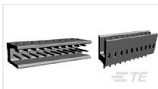
TE Part #826467-3 3P MOD II SHROUDED HEADER, ST