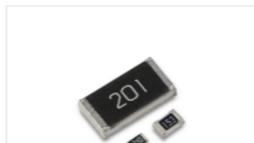
TE Part #4-2176330-3 CRGP 2010 33K 1%