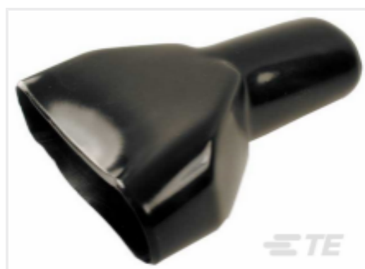
TE Part #DRC70-BT BOOT, 70P, 16SZ, PLG/REC, ST, BLK