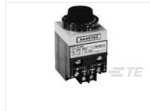
TE Part #2-1423157-0 7012AH=RLY,STD,ON,2P,120VAC,30