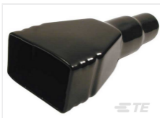
TE Part #DRC24-BT BOOT, 24P, 16SZ, PLG/REC, ST, BLK