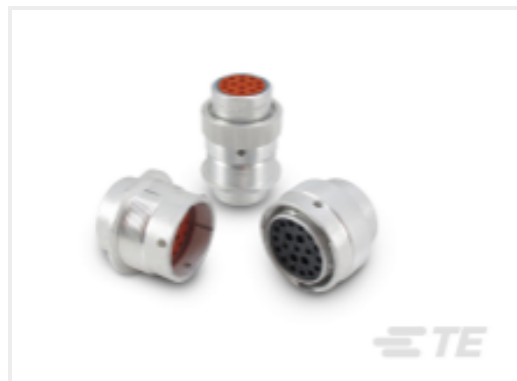
TE Part #HD36-18-14SN-072 DEUTSCH HD30 Housings