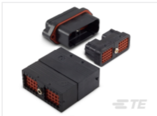
TE Part #DRC12-70PA DEUTSCH DRC Housings