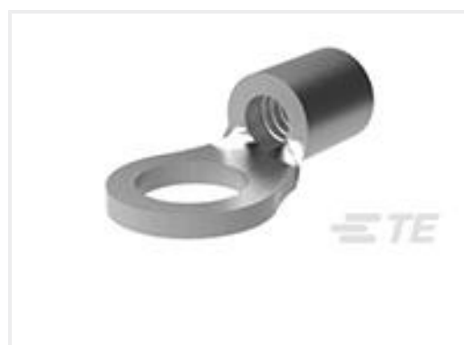
TE Part #33463 TERMINAL,SOLIS R 8 3/8