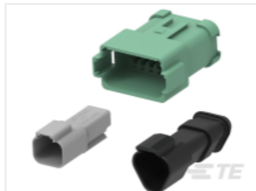
TE Part #DT04-4P-EP13 DEUTSCH DT Receptacle Connectors