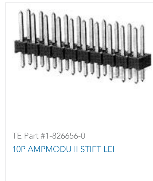
TE Part #1-826656-0 10P AMPMODU II STIFT LEI