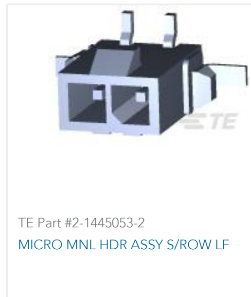
TE Part #2-1445053-2 MICRO MNL HDR ASSY S/ROW LF