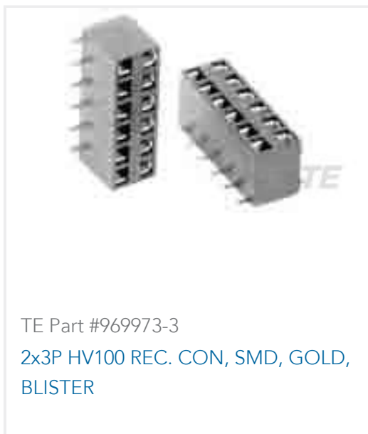
TE Part #969973-3 2x3P HV100 REC. CON, SMD, GOLD, BLISTER