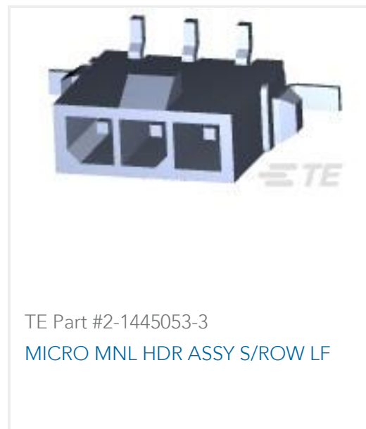
TE Part #2-1445053-3 MICRO MNL HDR ASSY S/ROW LF