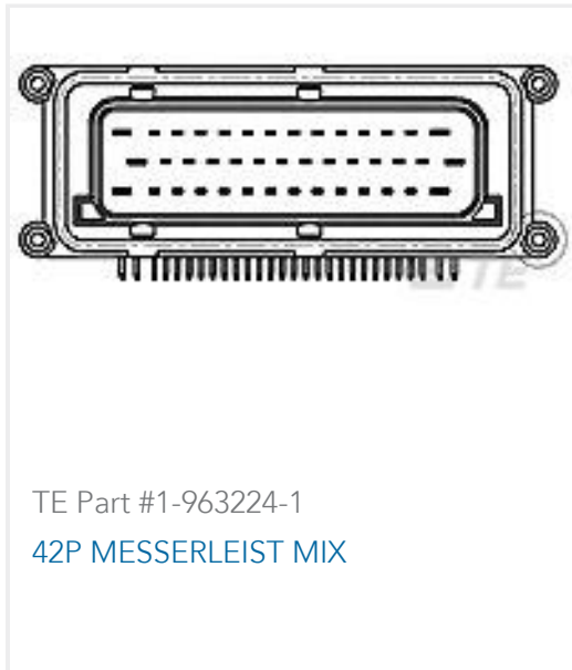
TE Part #1-963224-1 42P MESSERLEIST MIX