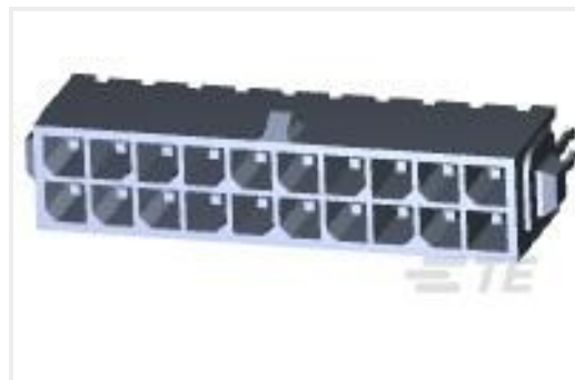
TE Part #5-794681-0 20P MICRO MNL ASSY,VRT,THRU,LF