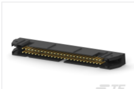
TE Part #5499913-2 AMP-LATCH UNIVERSAL HEADERS