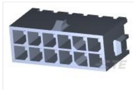
TE Part #4-794632-2 12P MICRO MNL ASSY,VRT,HDR,LF