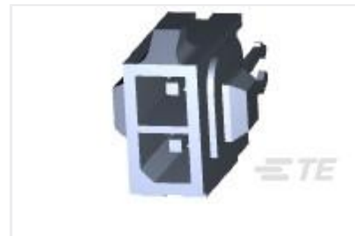
TE Part #3-794682-2 02P MICRO MNL ASSY,VRT,THRU,LF