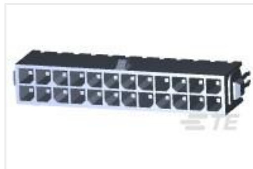
TE Part #5-794681-4 24P MICRO MNL ASSY,VRT,THRU,LF