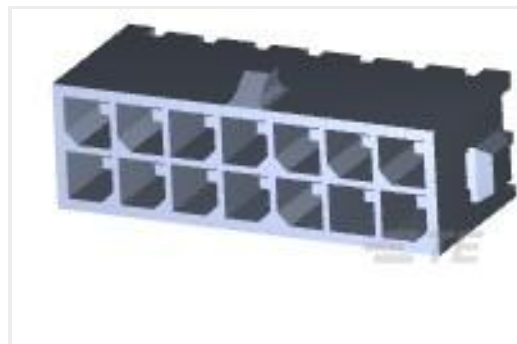
TE Part #4-794632-4 14P MICRO MNL ASSY,VRT,HDR,LF