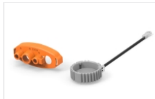
Connector Caps & Covers(34)