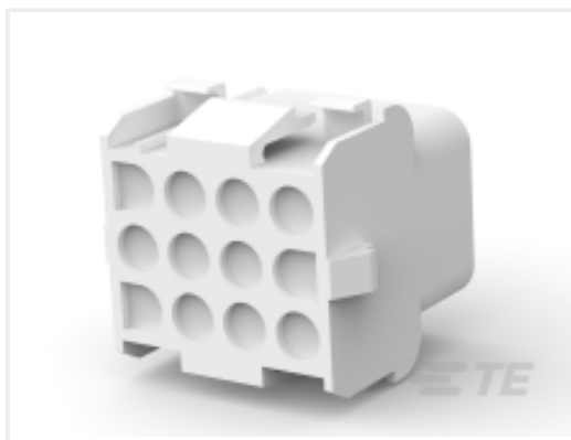
TE Part # 926681-1 UNIV.M-N-L.CAP HSG.