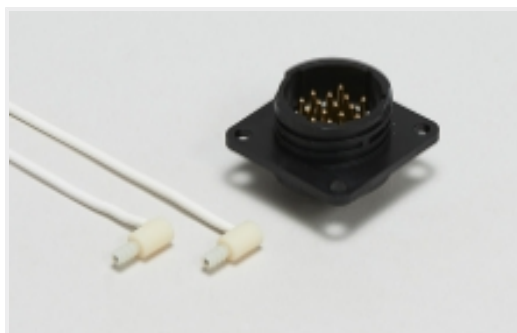
Circular Power Connectors(2)