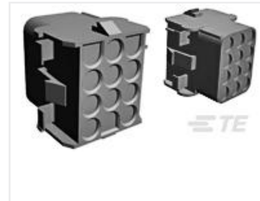
TE Part # 2178621-1 UMNL 12 WAY CAP HOUSING