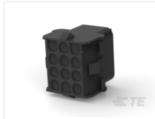
TE Part # 794727-1 12P UMNL CAP HSG NATL, BLACK