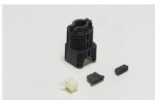
Rectangular Connector Housings(1)