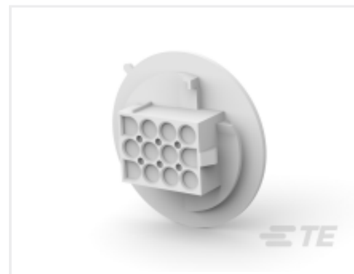
TE Part # 1586854-1 12P UMNL CAP HSG, GW