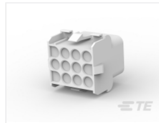
TE Part # 1863006-1 12P UMNL CAP HSG