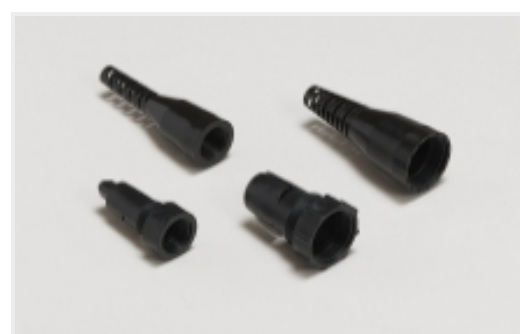
Connector Strain Relief(7)