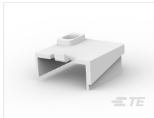
TE Part # 1-640723-0 12P UMNL STR/REL & INSRT NATL