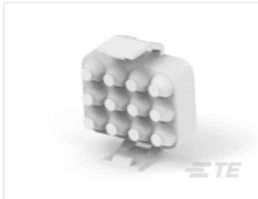
TE Part # 643255-1 12P UMNL ASSY MOD HSG VO