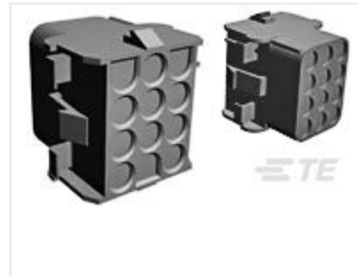
TE Part # 2178620-1 UMNL 12 WAY CAP HOUSING