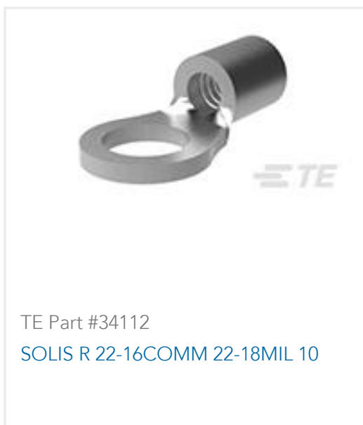
TE Part #34112 SOLIS R 22-16COMM 22-18MIL 10