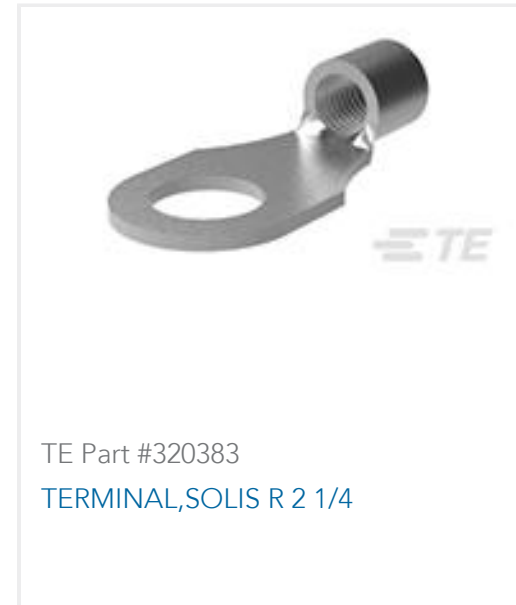
TE Part #320383 TERMINAL,SOLIS R 2 1/4