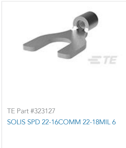
TE Part #323127 SOLIS SPD 22-16COMM 22-18MIL 6