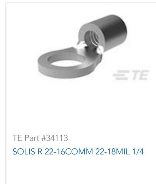
TE Part #34113 SOLIS R 22-16COMM 22-18MIL 1/4