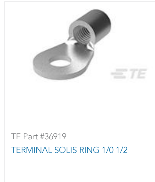
TE Part #36919 TERMINAL SOLIS RING 1/0 1/2