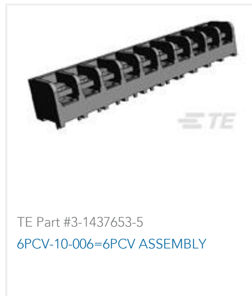
TE Part #3-1437653-5 6PCV-10-006=6PCV ASSEMBLY