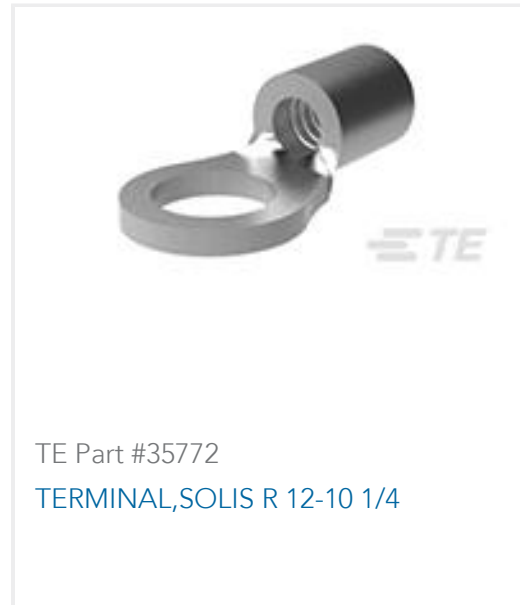
TE Part #35772 TERMINAL,SOLIS R 12-10 1/4