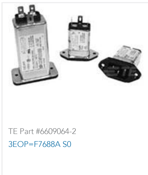
TE Part #6609064-2 3EOP=F7688A S0