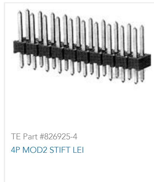
TE Part #826925-4 4P MOD2 STIFT LEI