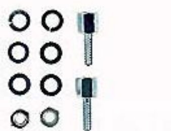
TE Part #5207719-3 KIT SCREWLOCK FEMALE CLEAR ZIN