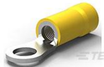
TE Part #1-330518-2 TERMINAL,PG R 12-10 10