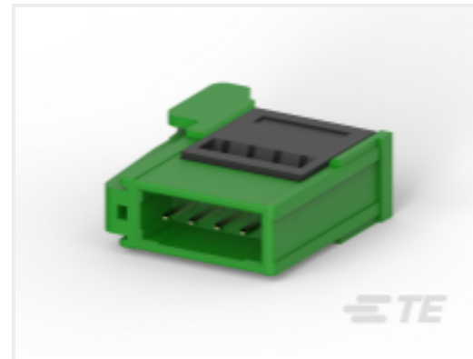
TE Part # 4-1473562-4 RITS CONN. PLUG ASSY 4P GREEN