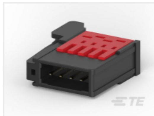
TE Part # 1-2295044-4 RITS CONN. PLUG ASSY 4P RED TIN