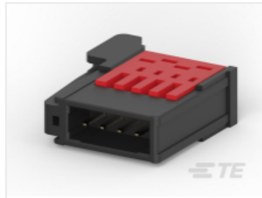
TE Part # 1-1473562-4 RITS CONN. PLUG ASSY 4P RED