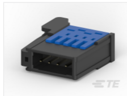
TE Part # 2-2295044-4 RITS CONN. PLUG ASSY 4P BLUE TIN