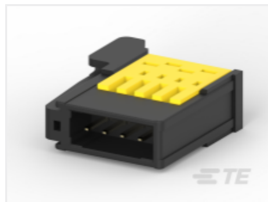
TE Part # 1473562-4 RITS CONN. PLUG ASSY 4P YELLOW