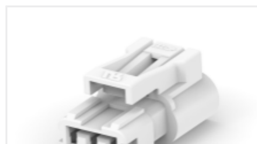
TE Part #2321918-3 Sealed Connector Housings: 2.5 mm, Signal Double Lock