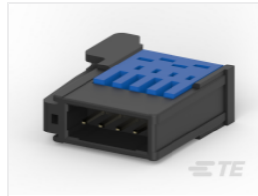
TE Part # 2-1473562-4 RITS CONN. PLUG ASSY 4P BLUE