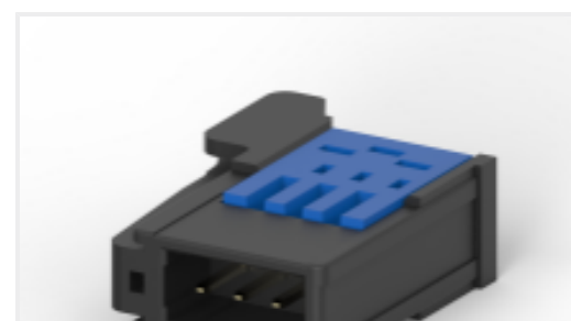
TE Part #2-2295044-3 RITS CONN. PLUG ASSY 3P BLUE TIN