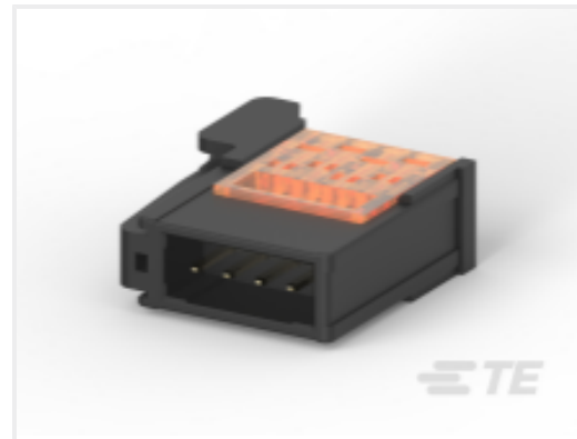
TE Part # 3-1473562-4 RITS CONN. PLUG ASSY 4P ORANGE