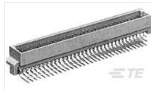
TE Part #5650473-5 ASSY,PIN,EUROCARD,TYPE C,LEAD-