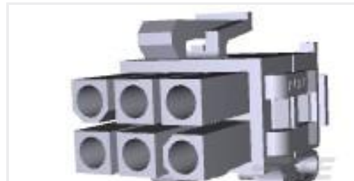
TE Part #794190-1 06P MINI UMNL2 PLUG HSG UL94V0