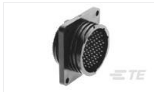
TE Part #1-206455-2 23-63 SZ CPC PSTD PIN RECPT LF