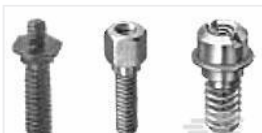
TE Part #750644-1 50SR SCREWLOCK KIT,FEMALE