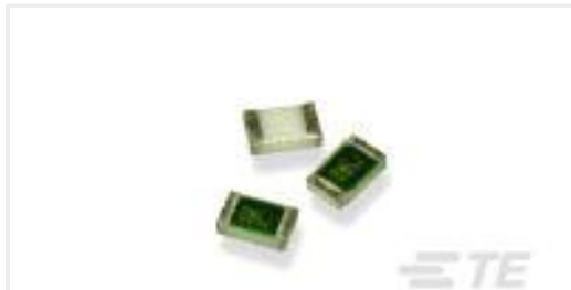
TE Part #6-1879336-2 CPF 0603 1K0 1% 50PPM 1K RL