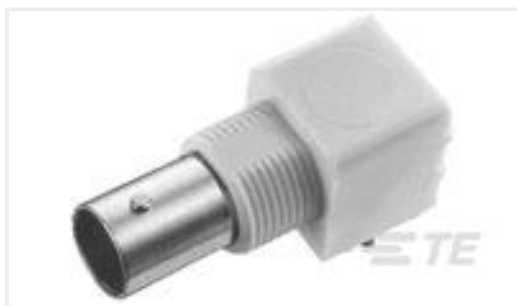
TE Part #5227161-7 RTANG JACK W/MTG PINS, BNC PCB